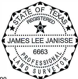
EXHIBIT OF A 16.371 ACRE TRACT