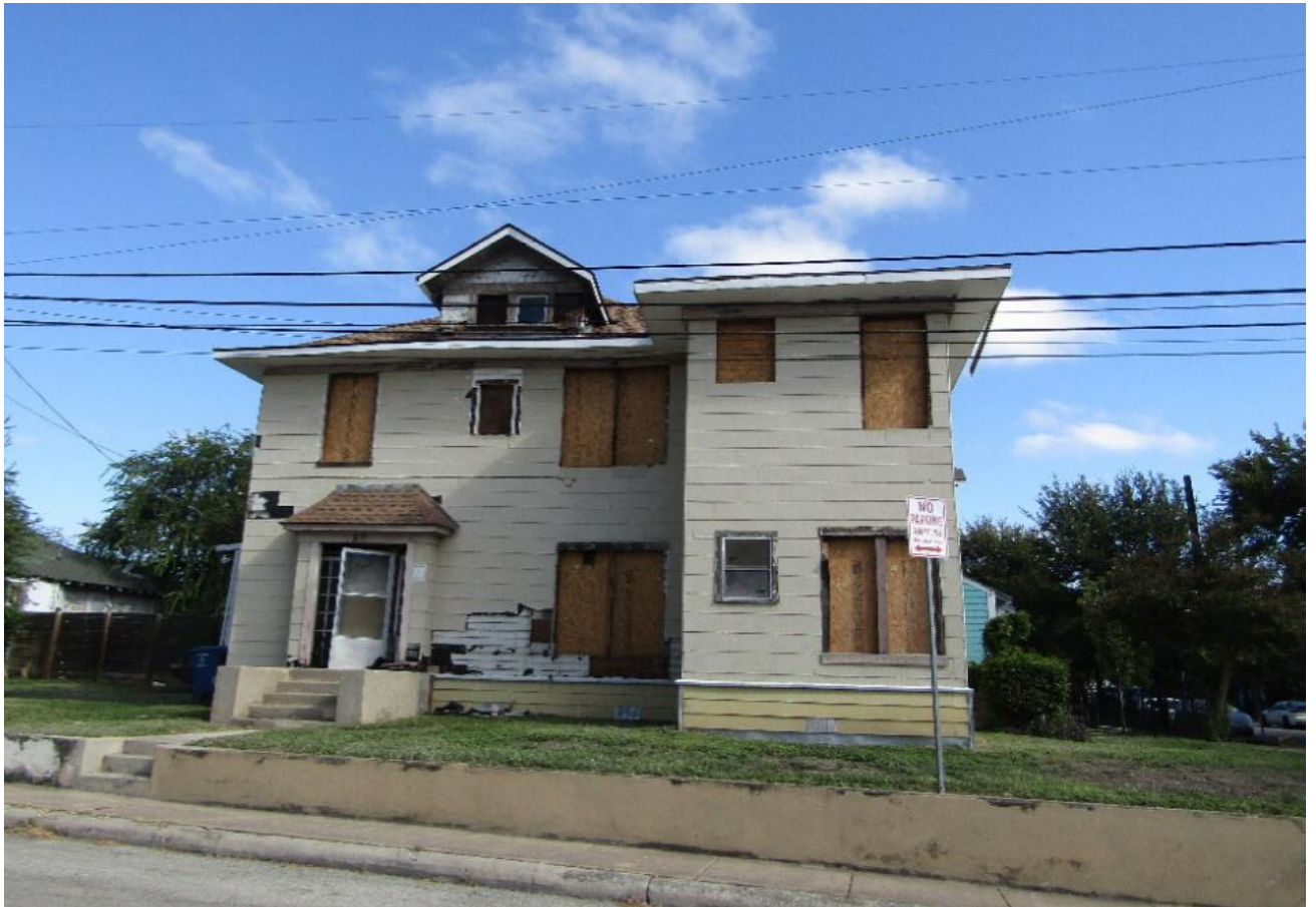
Views from Myrtle Street