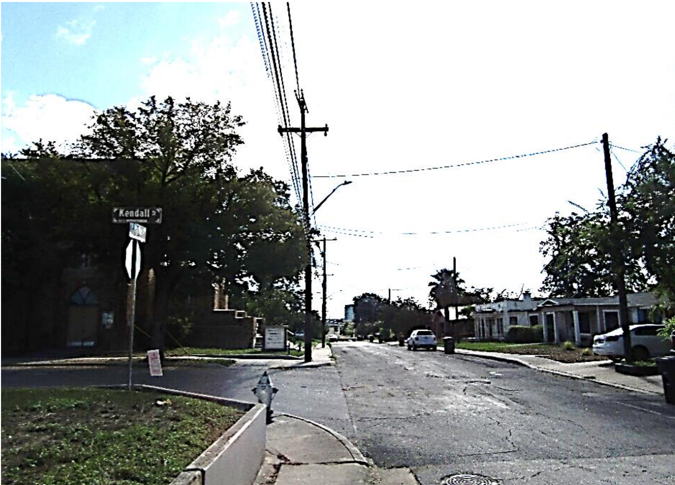
West view of Myrtle Street