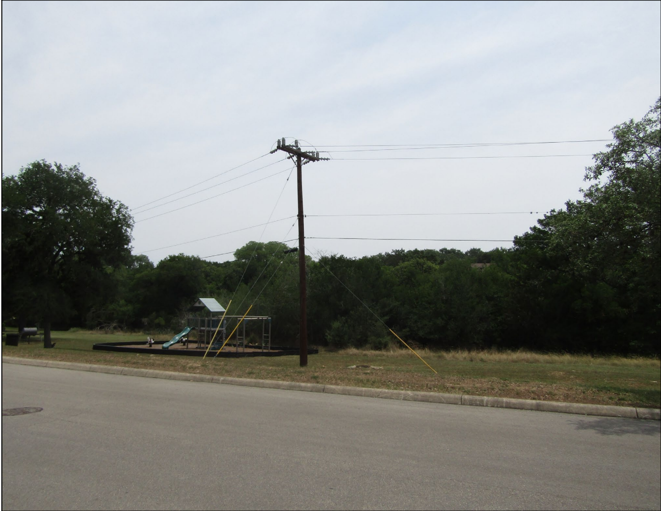
View across from subject property