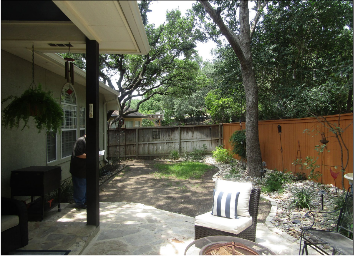
PUD Perimeter fence separates PUD residence from abutting Non-PUD residence.