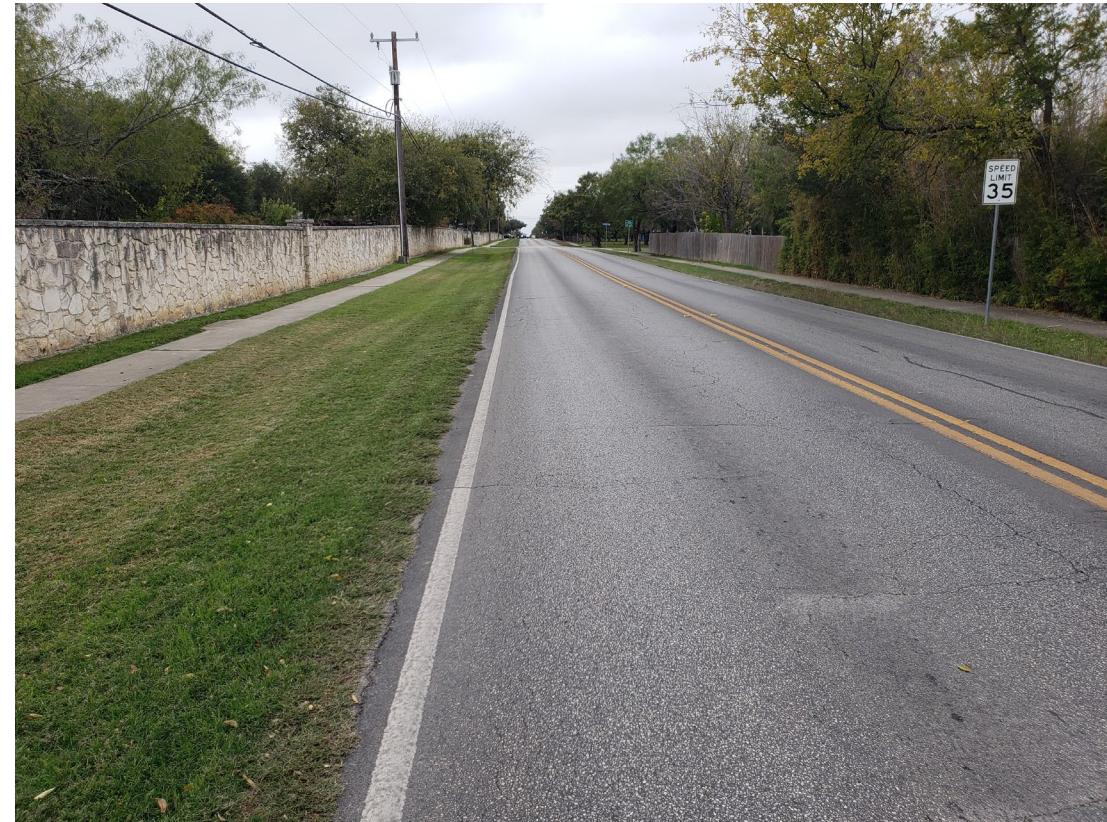
Shared Use Path will be adjacent to Abe Lincoln Road