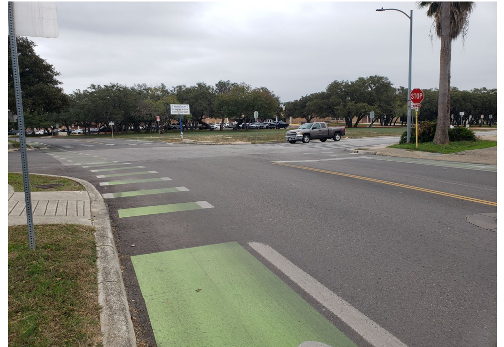
Existing bike lanes at Horn Boulevard