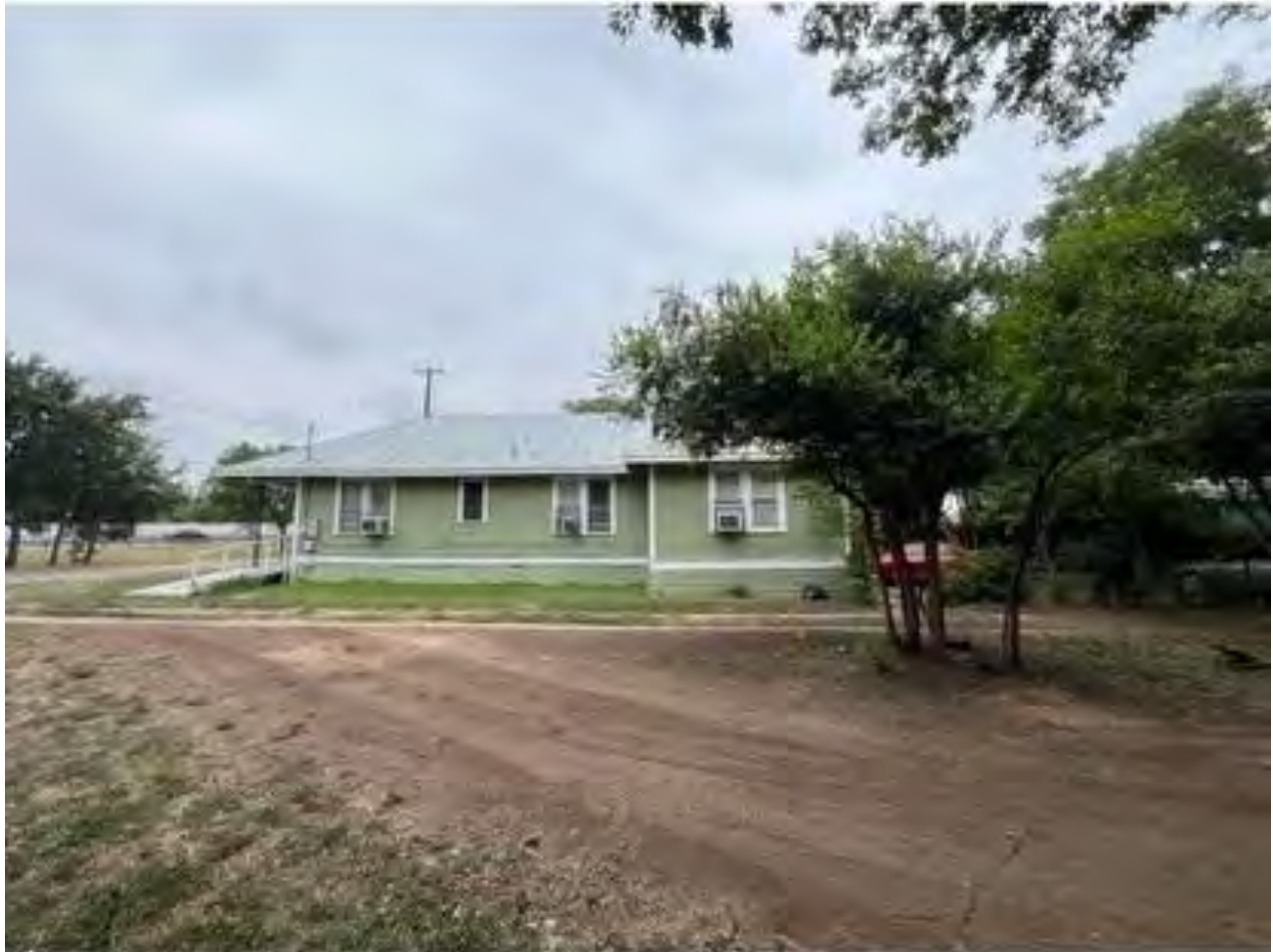
2. 429 Harriman Place – Right façade (East)