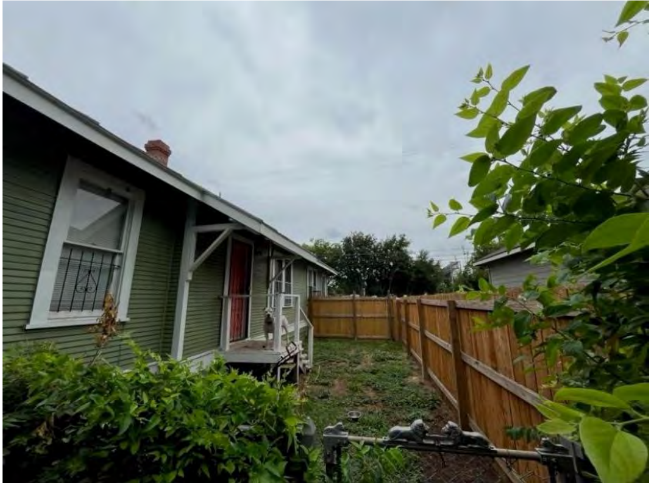
3. 429 Harriman Place – Northwest oblique

100 W. HOUSTON ST., SAN ANTONIO, TEXAS 78205