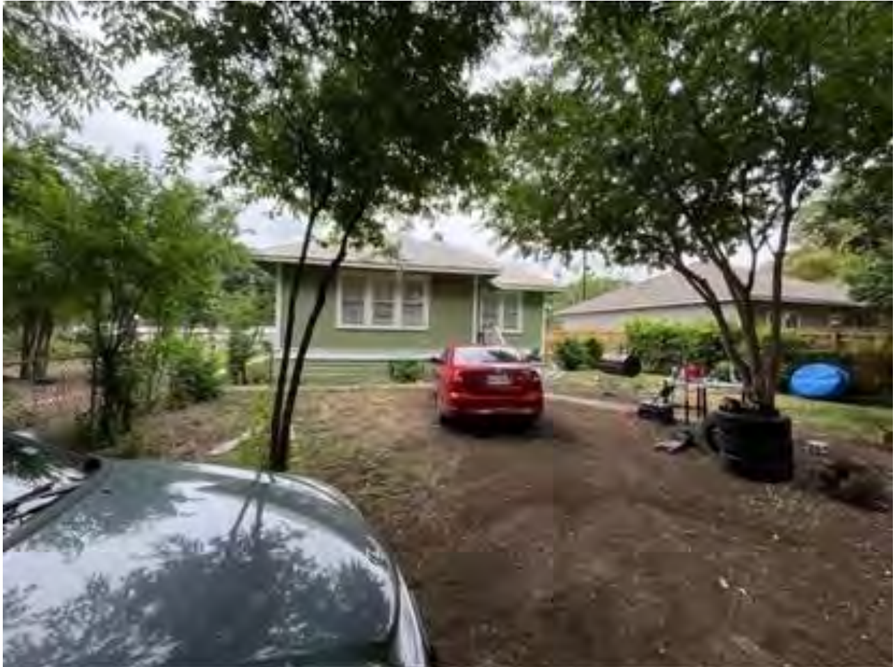
4. 429 Harriman Place – Rear

100 W. HOUSTON ST., SAN ANTONIO, TEXAS 78205