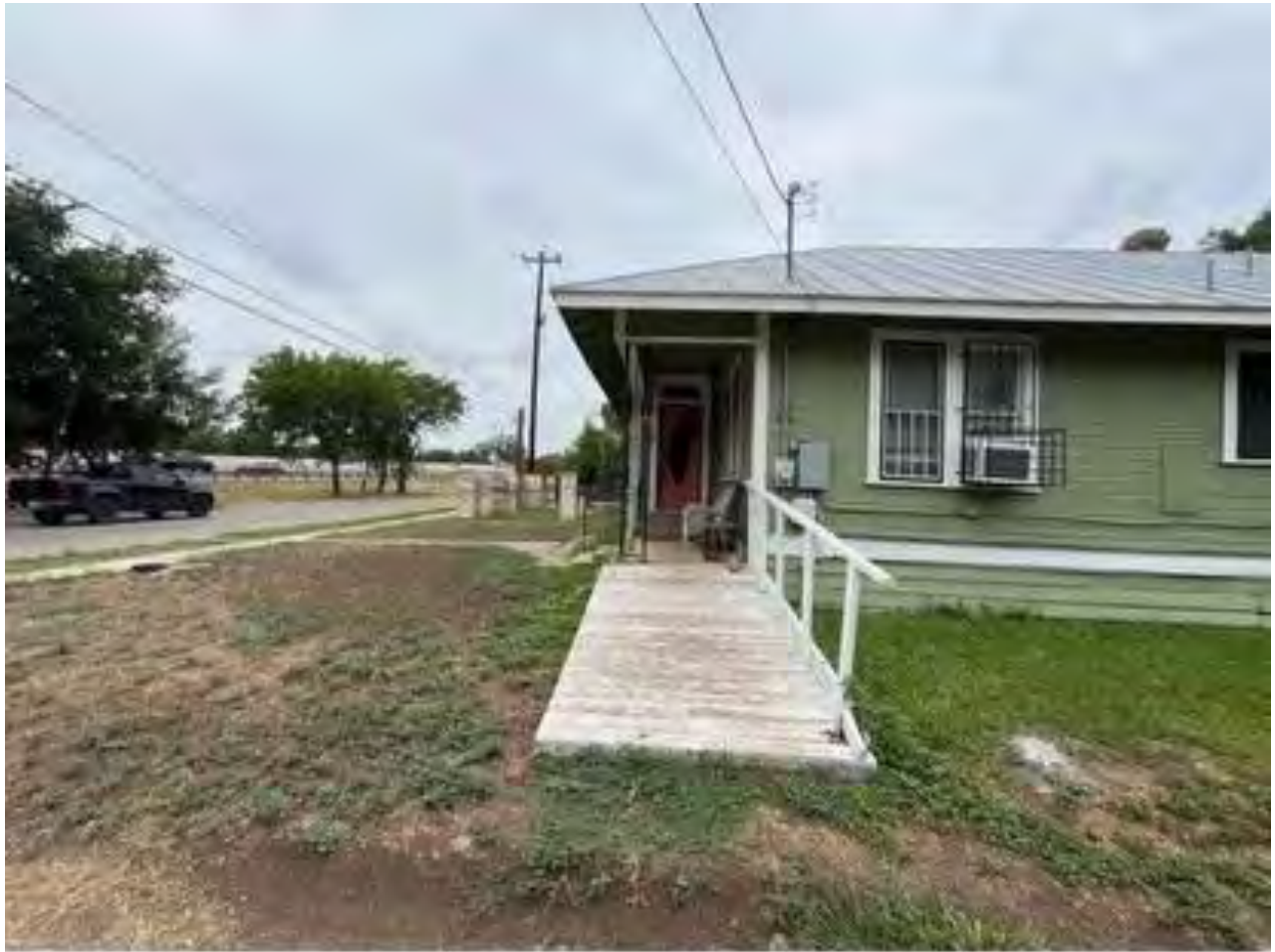
5. 429 Harriman Place – Wheelchair ramp detail