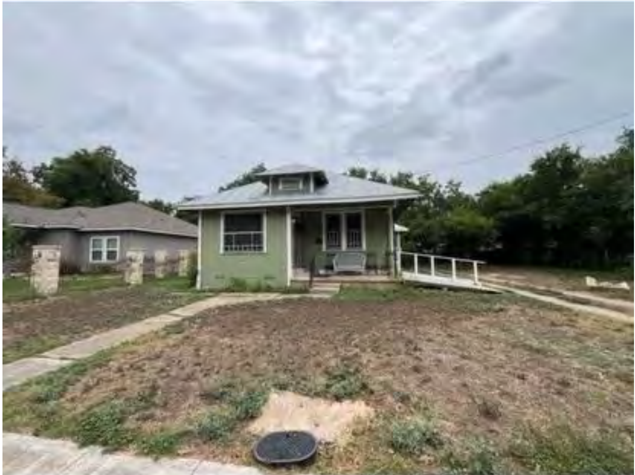
1. 429 Harriman Place – Front façade