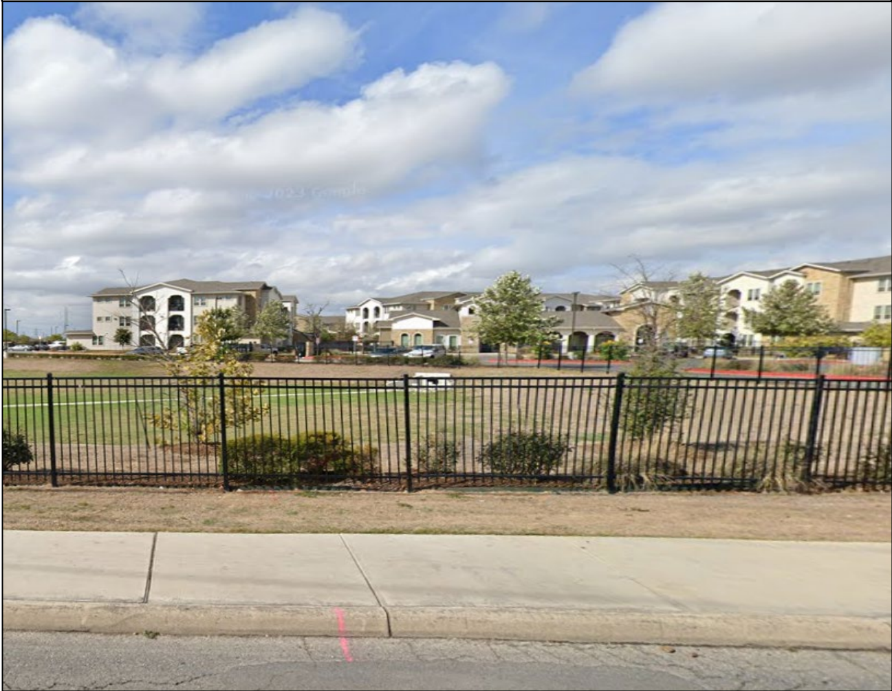
View across from subject property (Lucero Apartments)