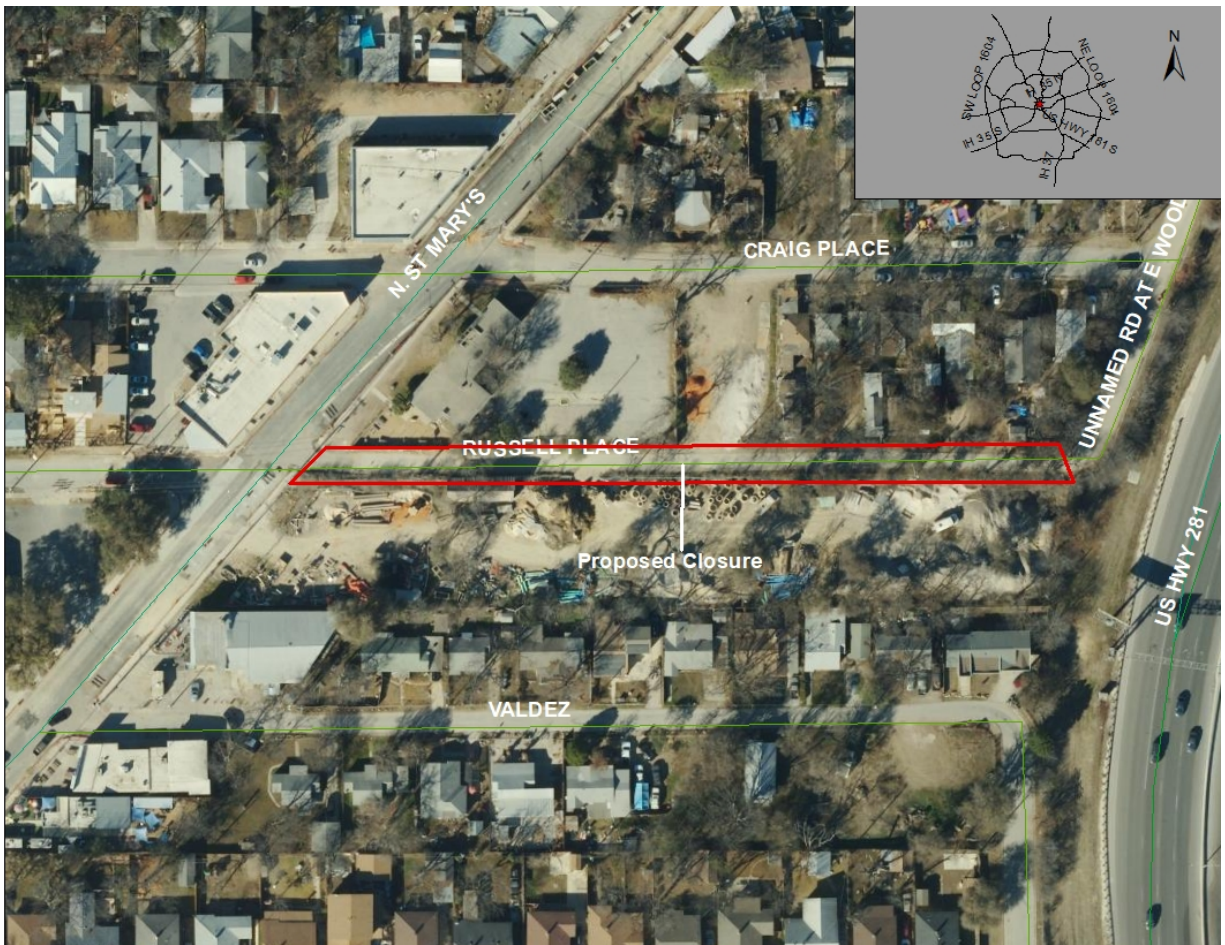
Aerial Map of Proposed Closure