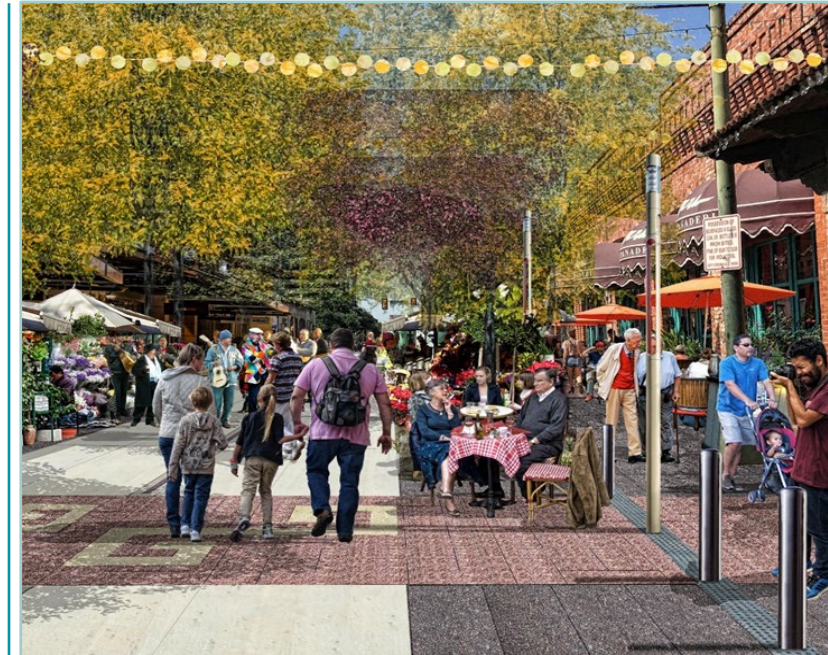
San Saba Street Concept