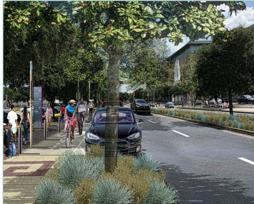
Santa Rosa Street Concept