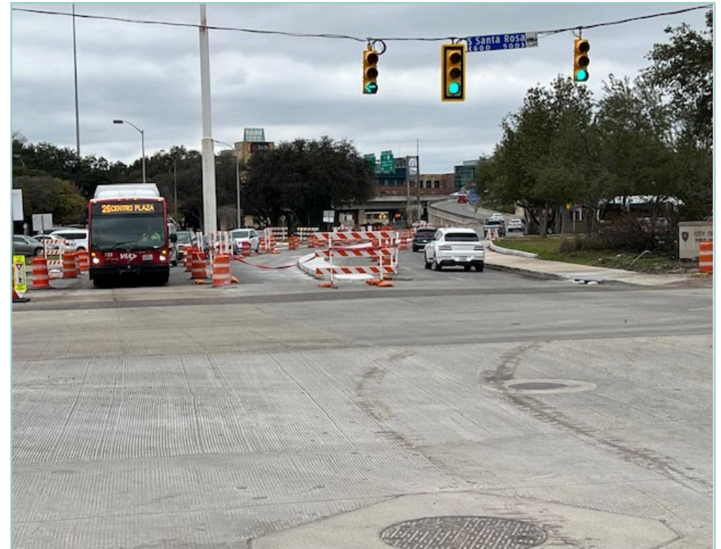
Cesar Chavez at Santa Rosa Intersection