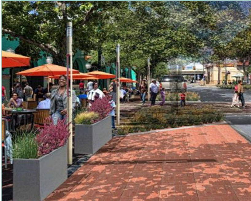
Commerce Street Concept

Contract Amendment will compensate the contractor for work and costs associated with replacing the gas main and street restoration at Santa Rosa and Nueva Street intersection related to Santa Rosa Streets project.