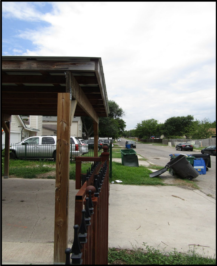
Views and measurements of Clear Vision