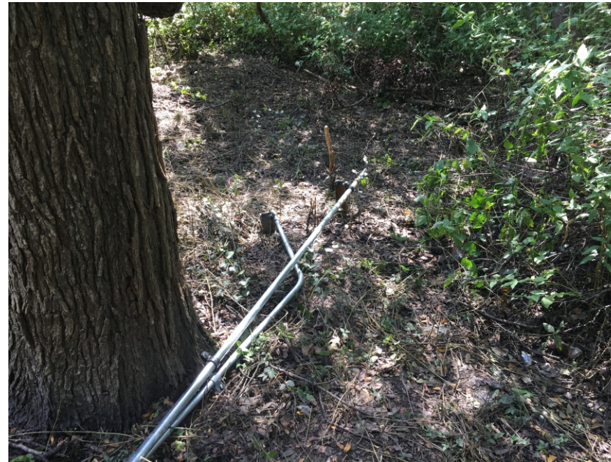
Stage Sensor and Sampler conduit lines