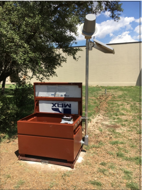
Typical Jobsite Box installation