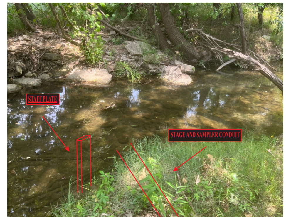
Creek installation features