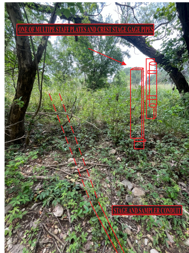
One of multiple Staff Plate and CSG pipe installations