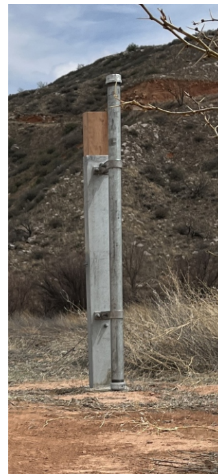
Crest Stage Gage pipe