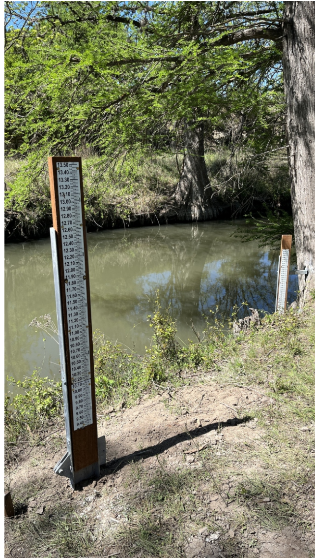
USGS type enamel break-a-way Staff Plates