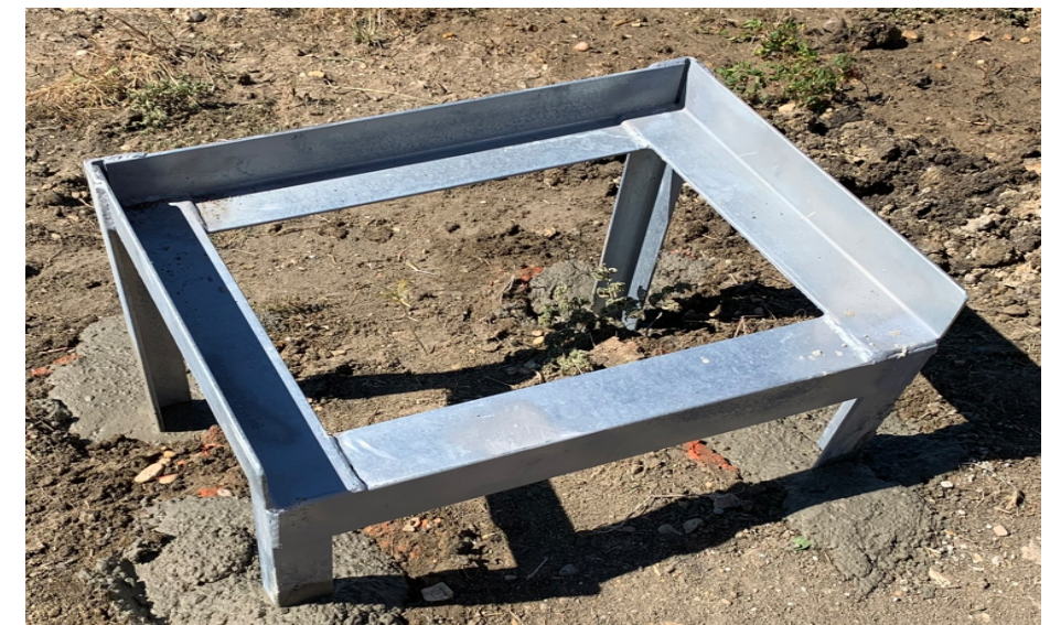
Gage Shelter stand