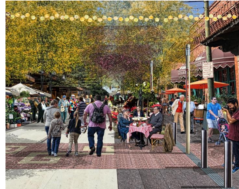
San Saba Street