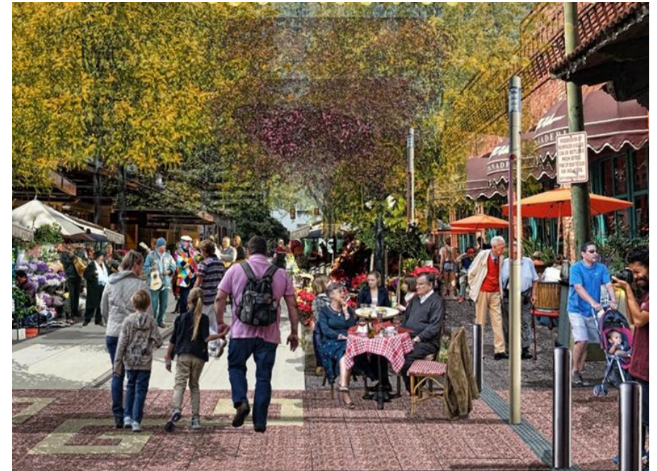
San Saba Street