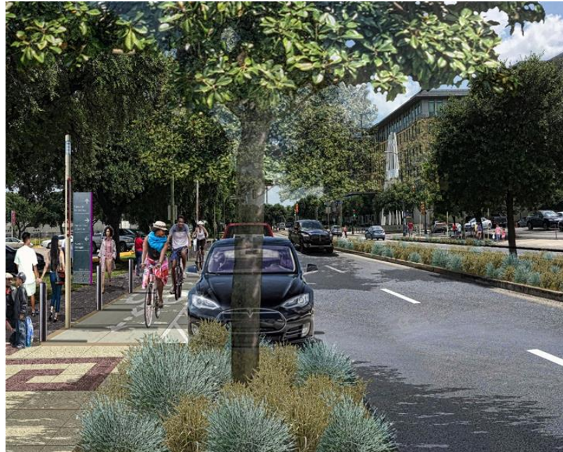
Santa Rosa Street