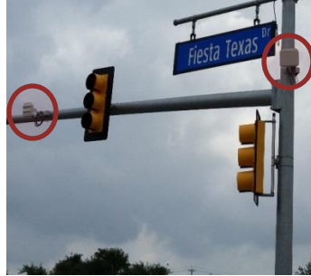
Steel Mast Arms & Vehicle Detection