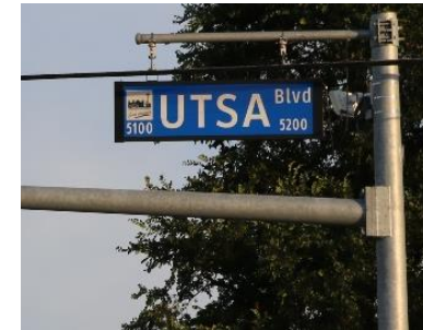
Illuminated Street Signs