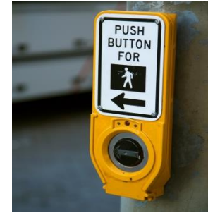
Audible Pedestrian System