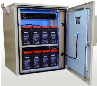
Battery Backup System