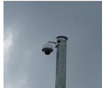
Traffic Monitoring Cameras