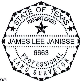
EXHIBIT OF A 35.668 ACRE TRACT

ANTONIO ZAMORA SURVEY NO. 36 ABSTRACT NO. 828 AND JEFFERY B. HILL SURVEY NO. 103 ABSTRACT NO. 308 N.C.B.18225 COUNTY BLOCK 5088, BEXAR COUNTY, TEXAS CITY OF SAN ANTONIO, E.T.J., BEXAR COUNTY, TEXAS CITY OF SAN ANTONIO, BEXAR COUNTY, TEXAS