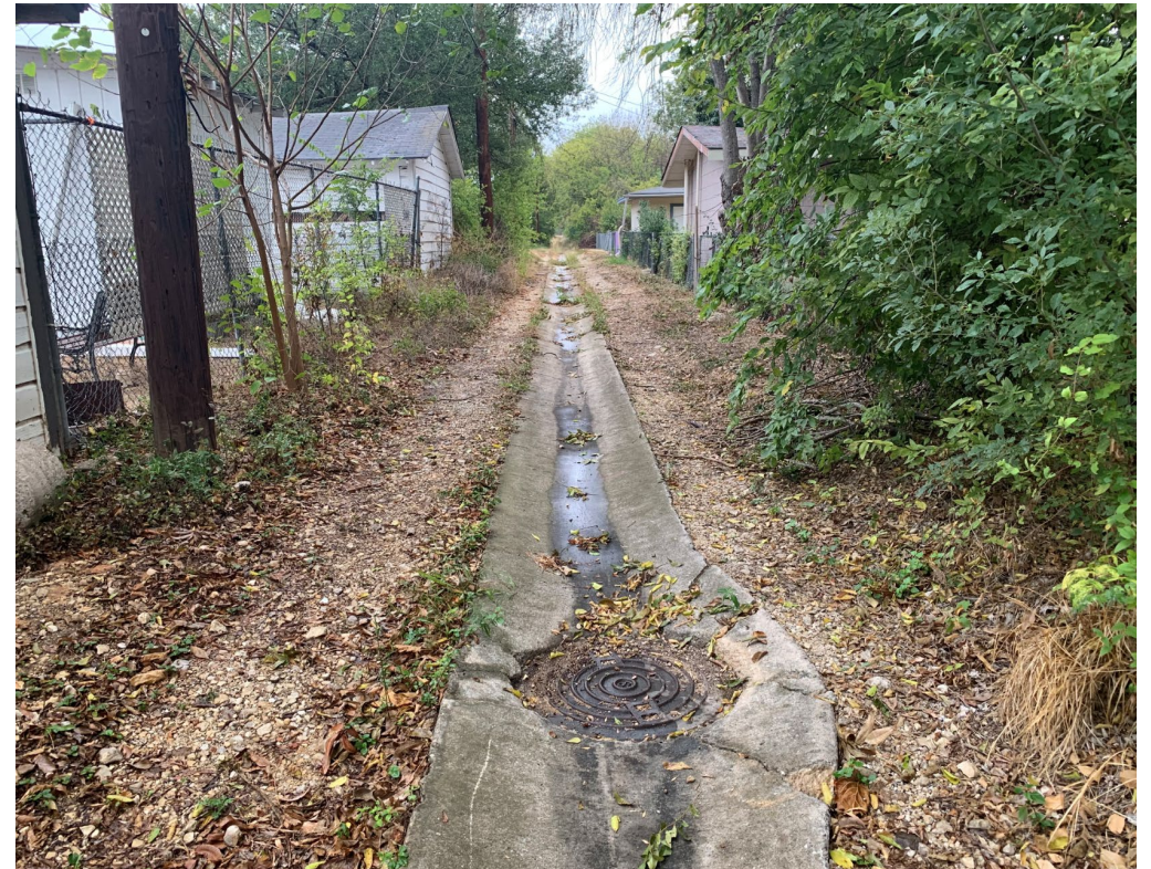
Existing alley between Leming Drive and Quentin Drive