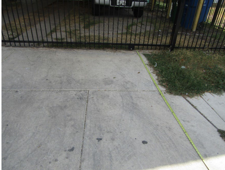
Front Approach Measurement