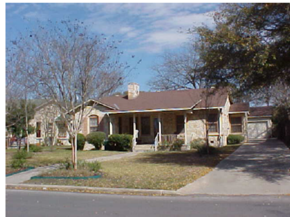
Common front walk and driveway configuration