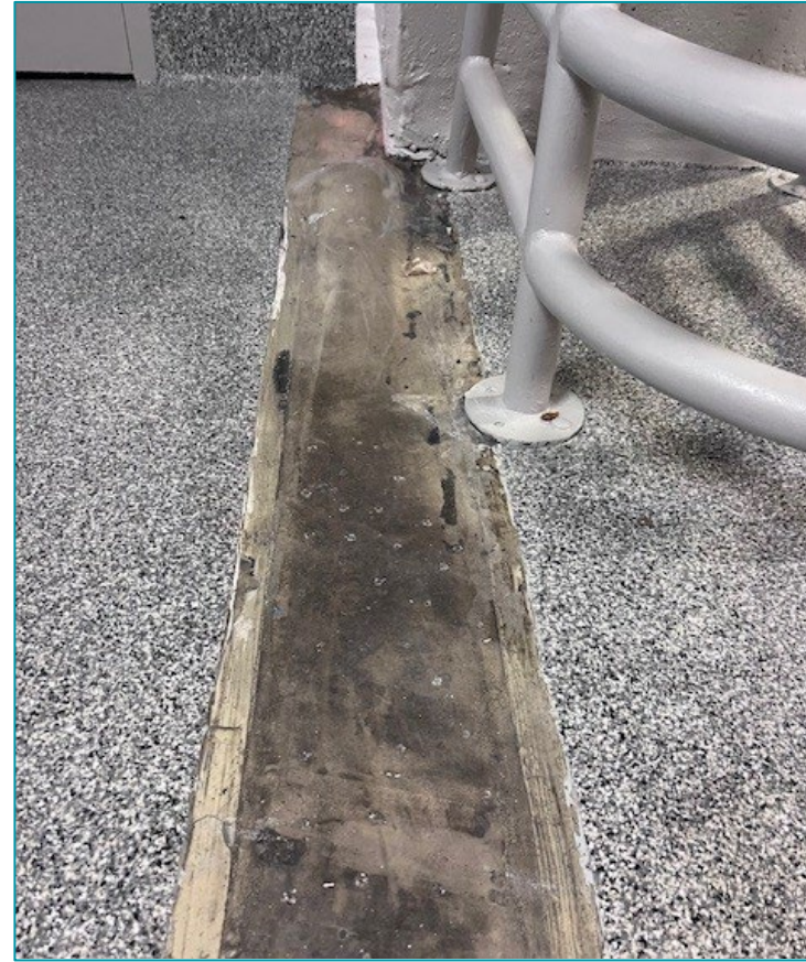
Existing Expansion Joints