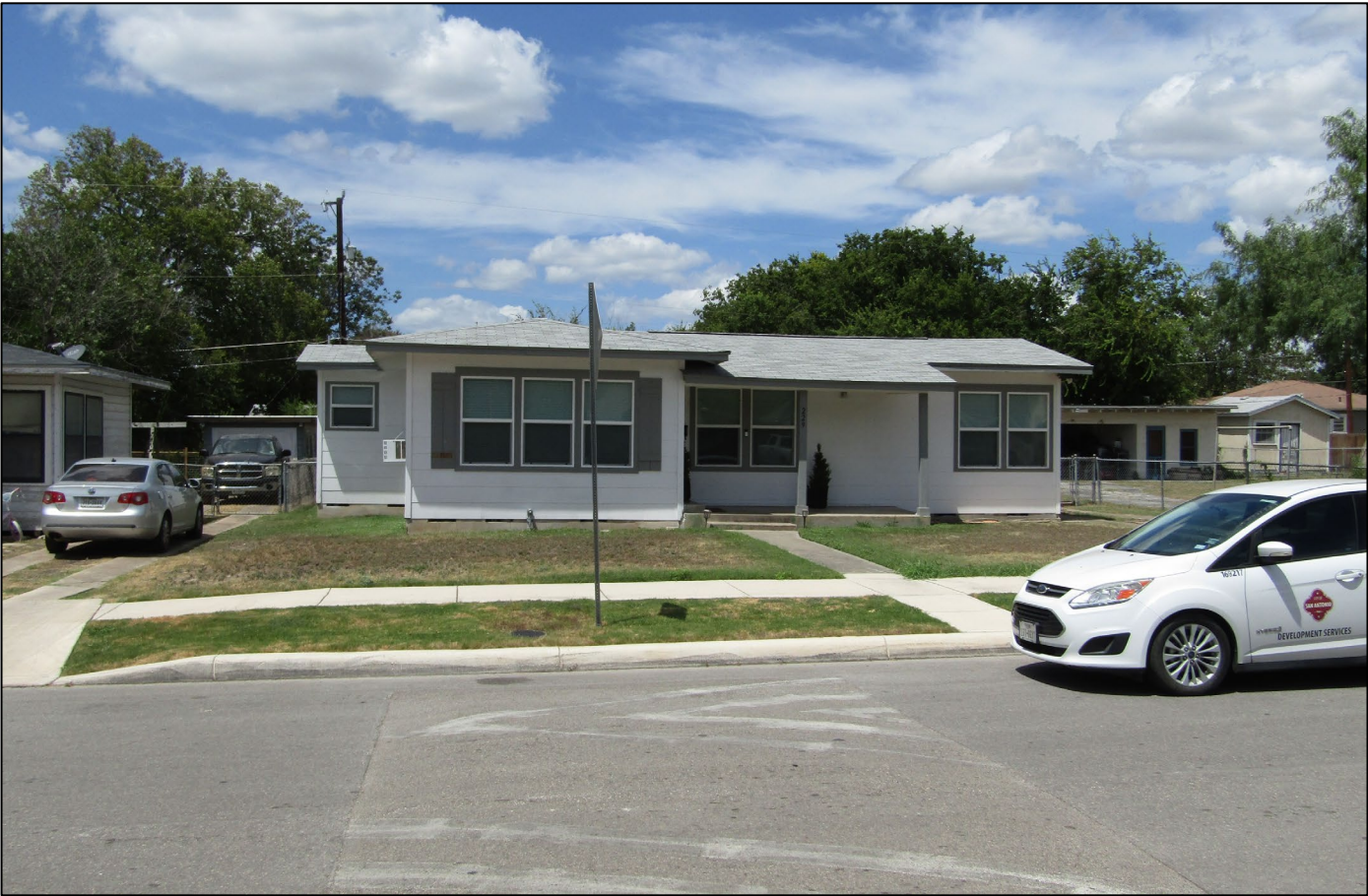
View across from subject property