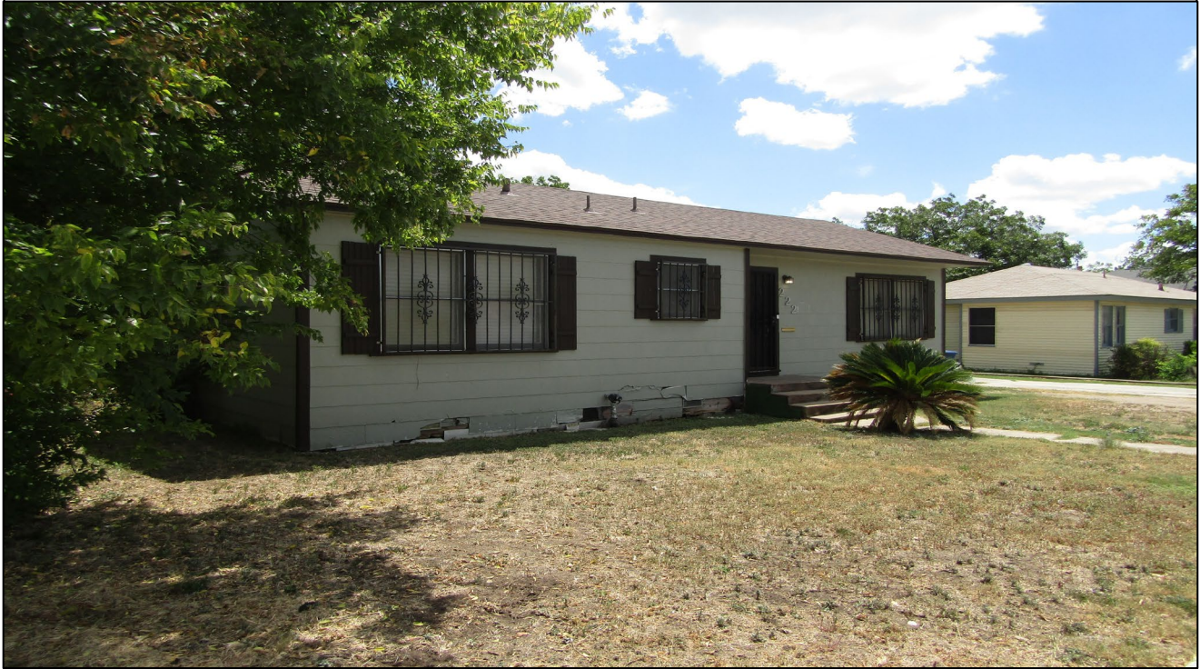
East view of Greer Street towards South Olive Street