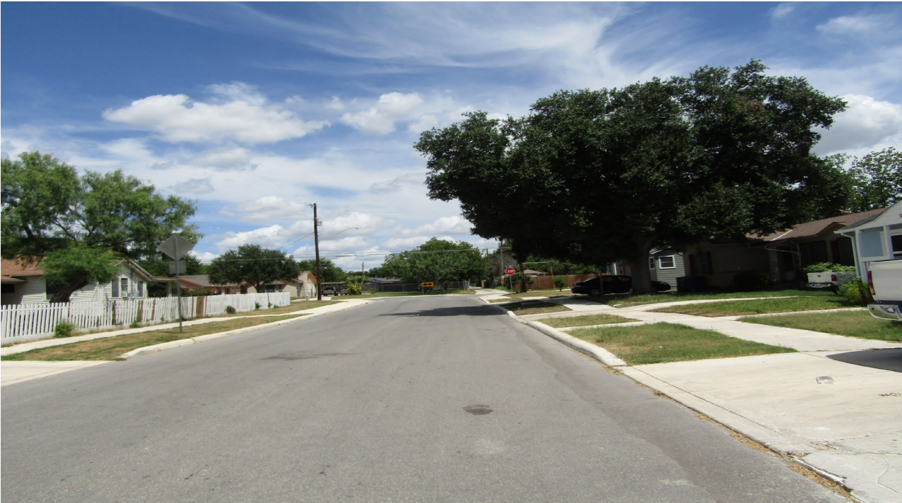
West view of Greer Street towards South Pine Street