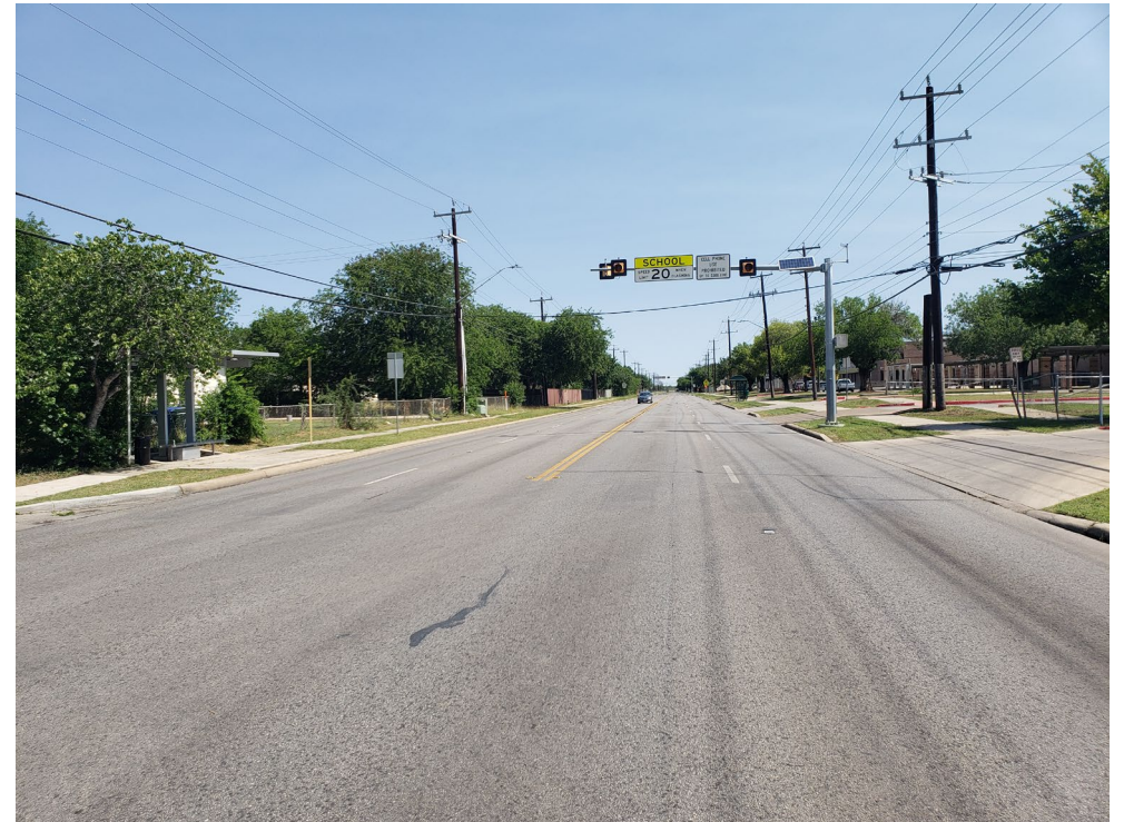
Pinn Road by Anson Jones Middle School