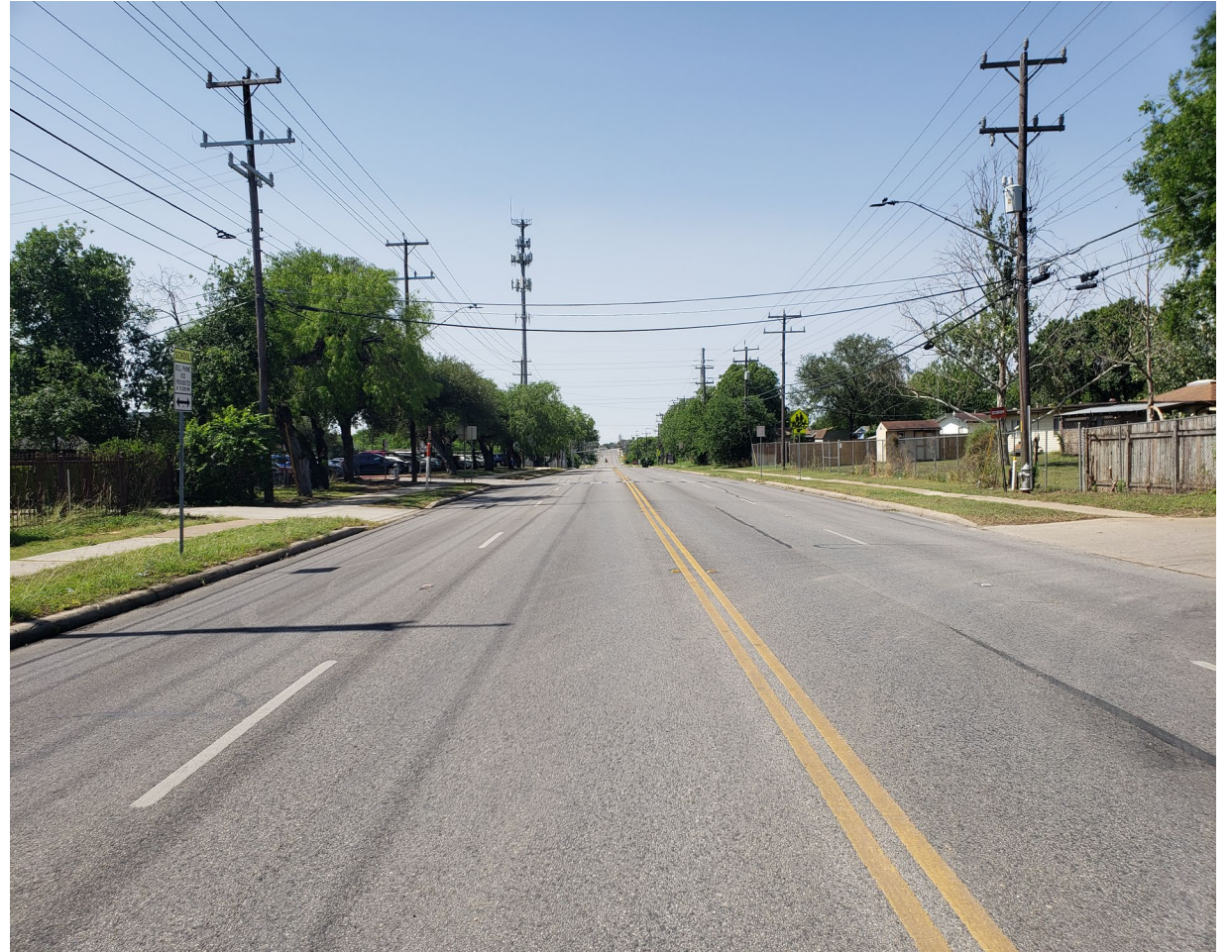
Shared Use Path will be adjacent to Pinn Road