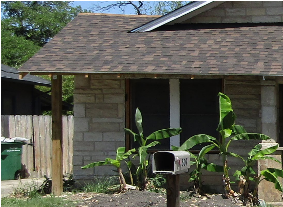
Subject Property – Patio Cover