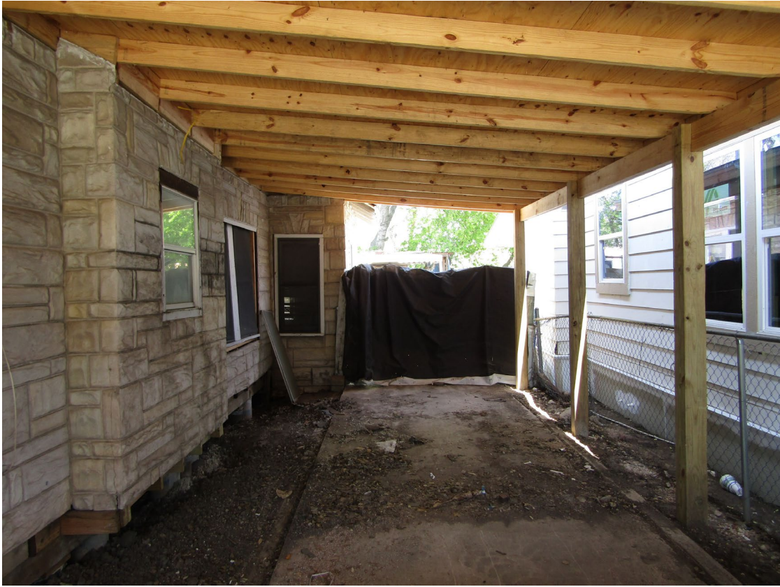
Subject Property – Carport