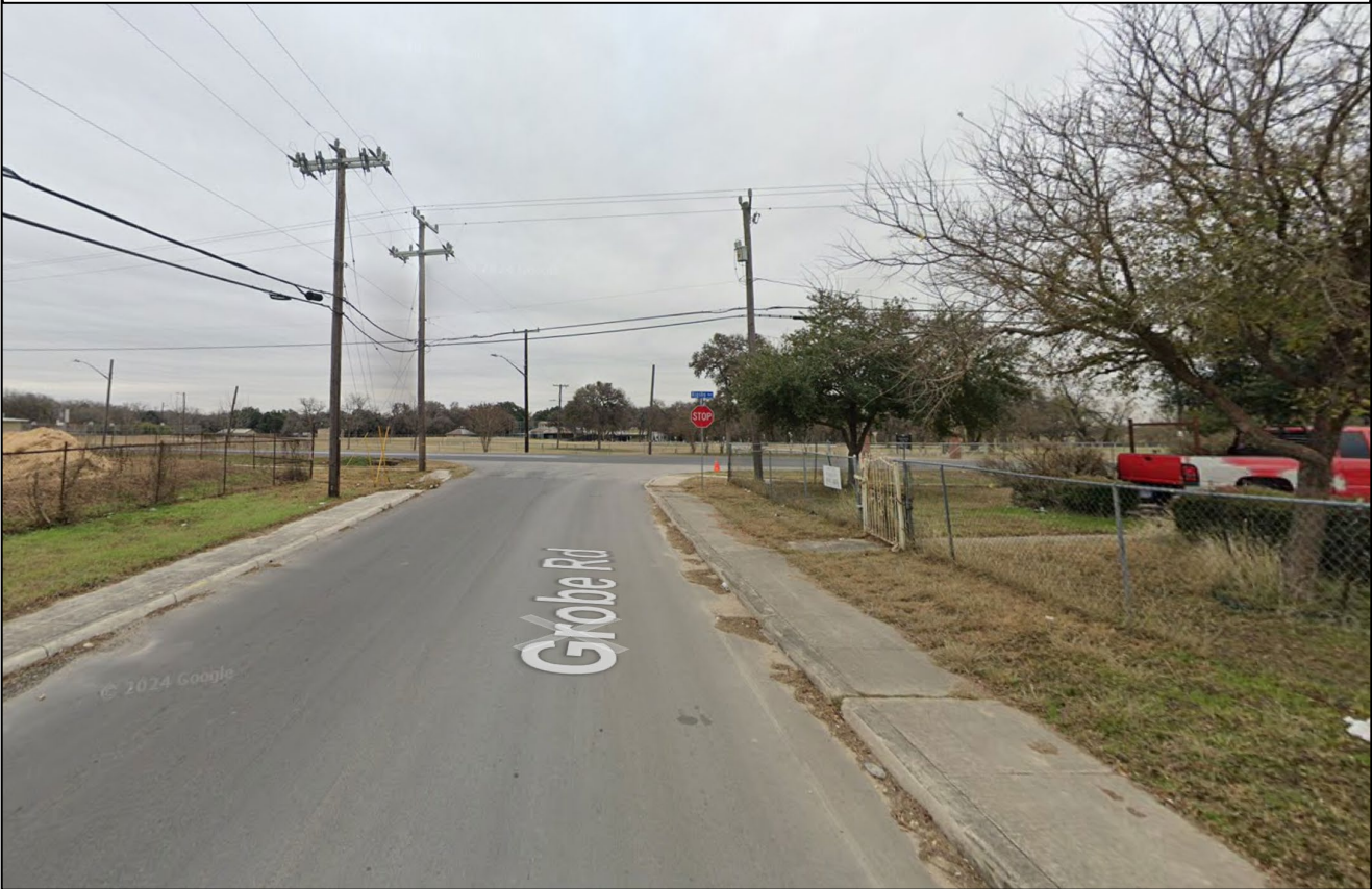
West view from Grobe Drive towards Rigsby Avenue