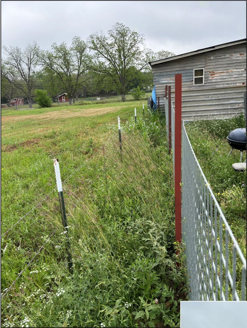
Side View of Accessory Structure