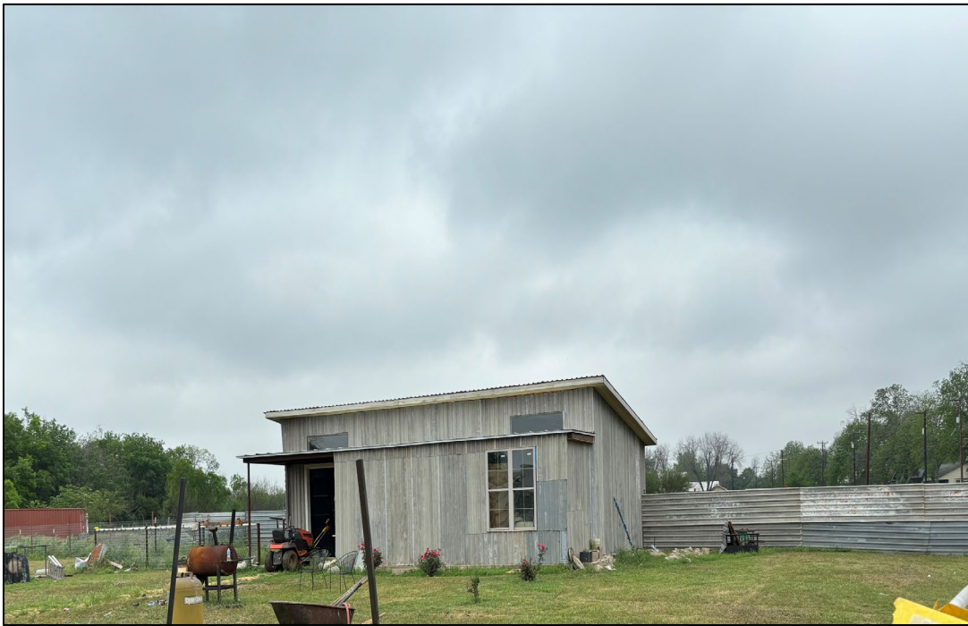
Views of Corrugated Metal Fence