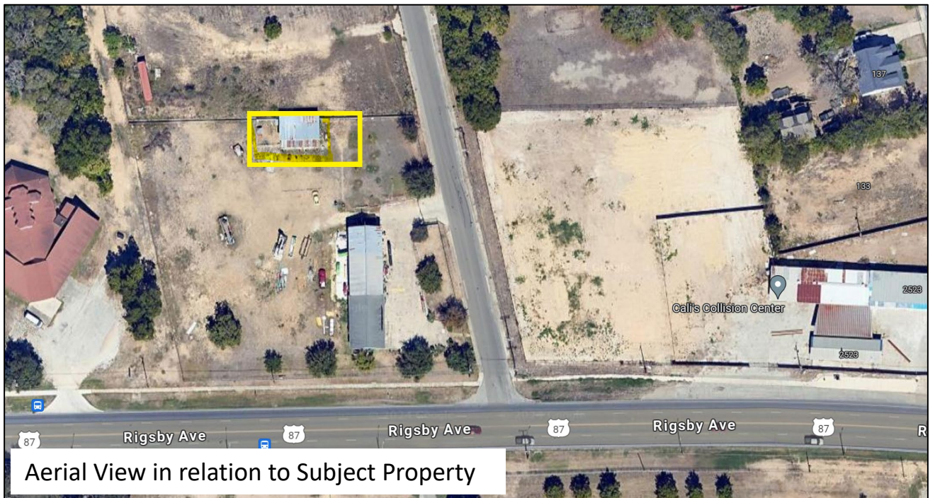
Aerial View in relation to Subject Property