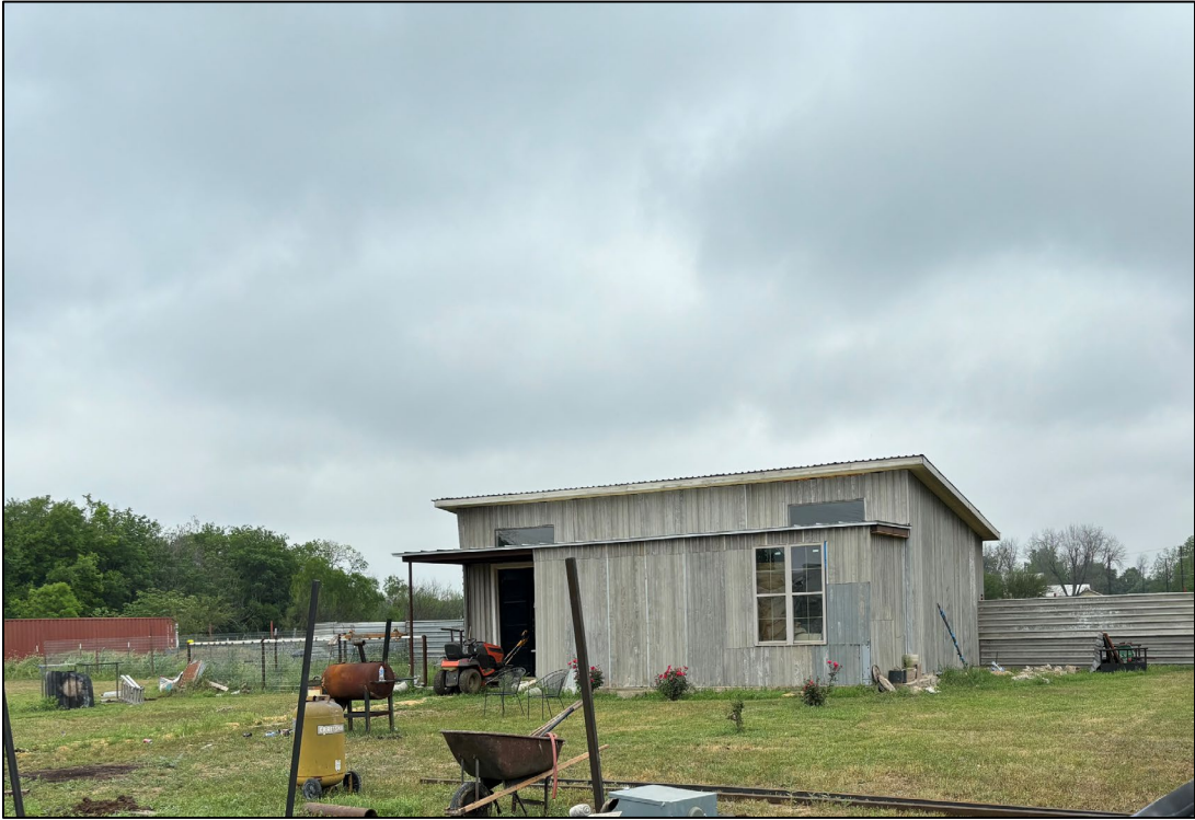
Front Views of Accessory Structure