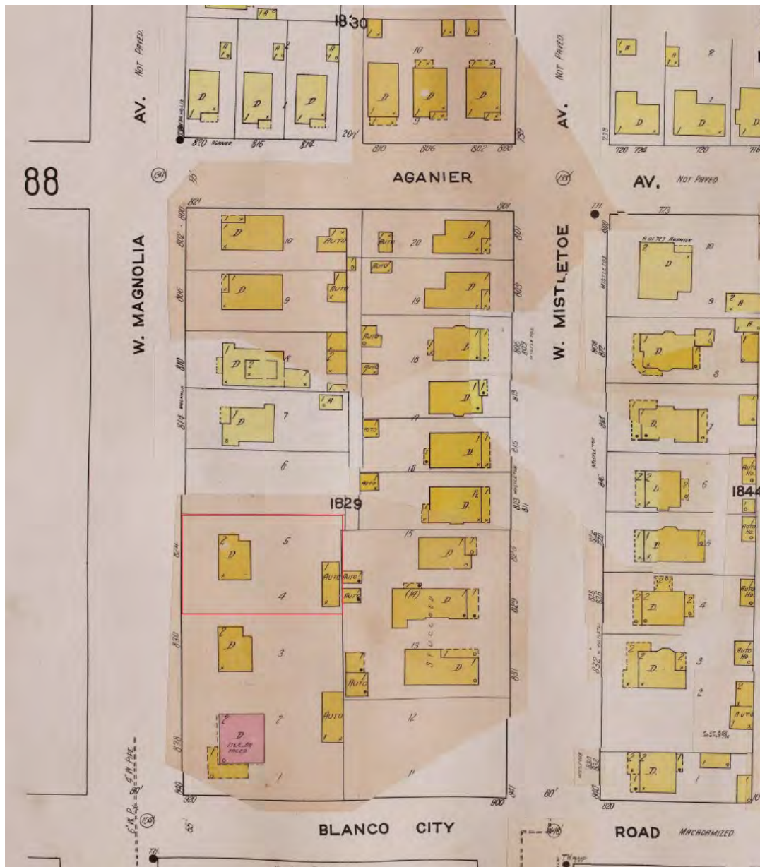
6. Sanborn Map (1931), Vol.1, Sheet 89

100 W. HOUSTON ST., SAN ANTONIO, TEXAS 78205