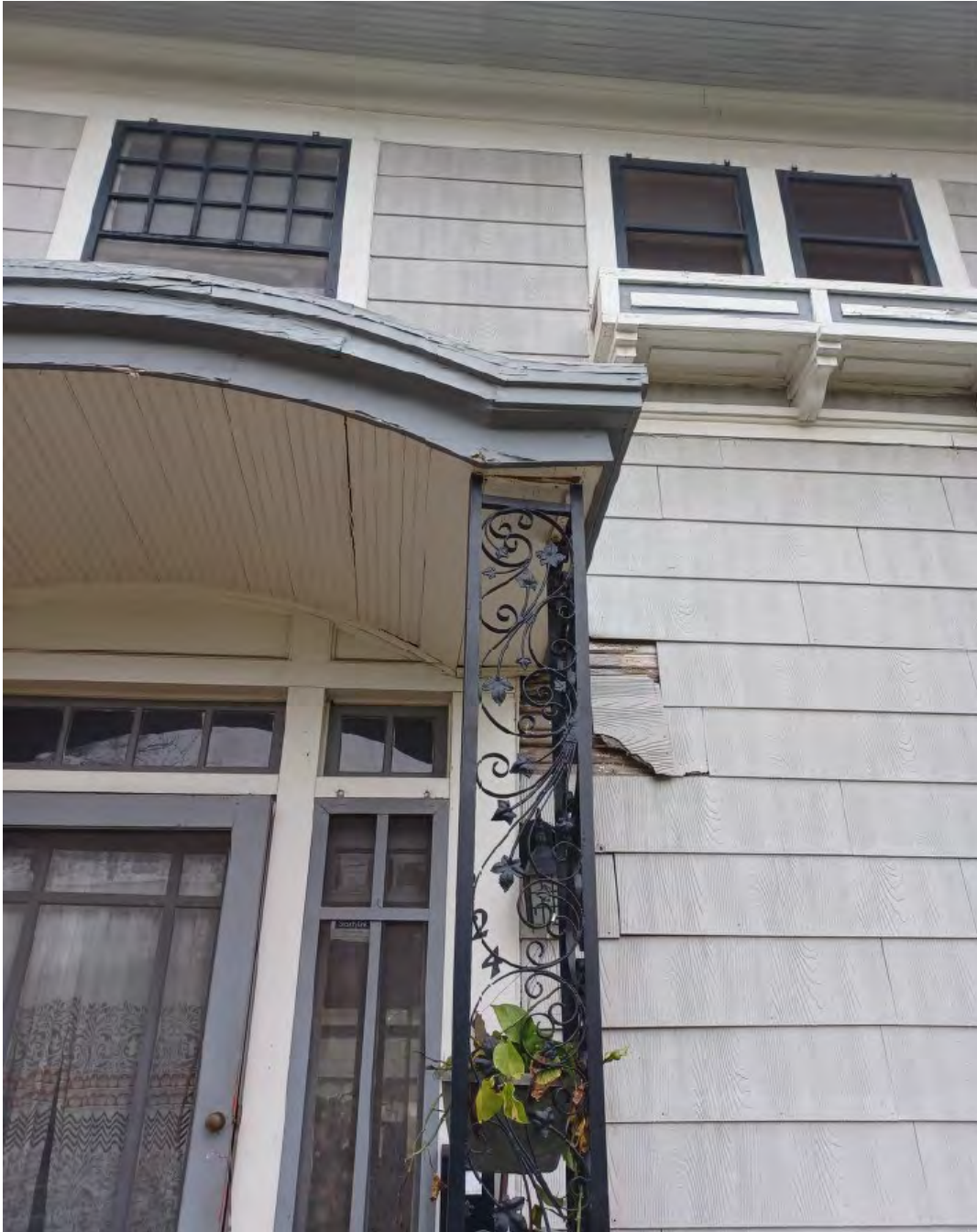
5. 824 West Magnolia Avenue –detail

100 W. HOUSTON ST., SAN ANTONIO, TEXAS 78205