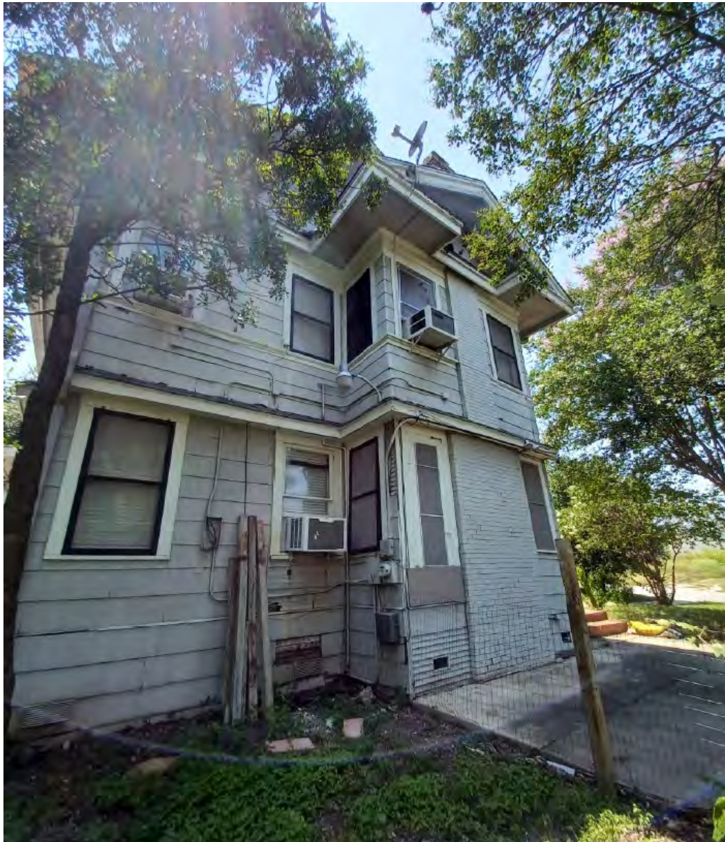
3. 824 West Magnolia Avenue – Left side (East)