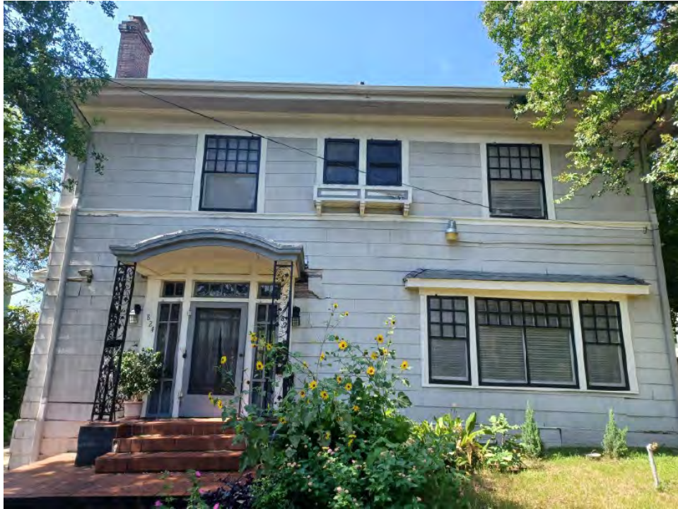
1. 824 West Magnolia Avenue – Front façade

100 W. HOUSTON ST., SAN ANTONIO, TEXAS 78205