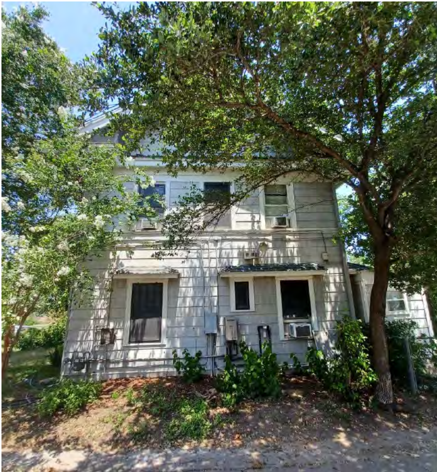
2. 824 West Magnolia Avenue – Right side (West)

100 W. HOUSTON ST., SAN ANTONIO, TEXAS 78205