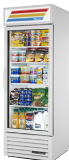
Optional White Exterior