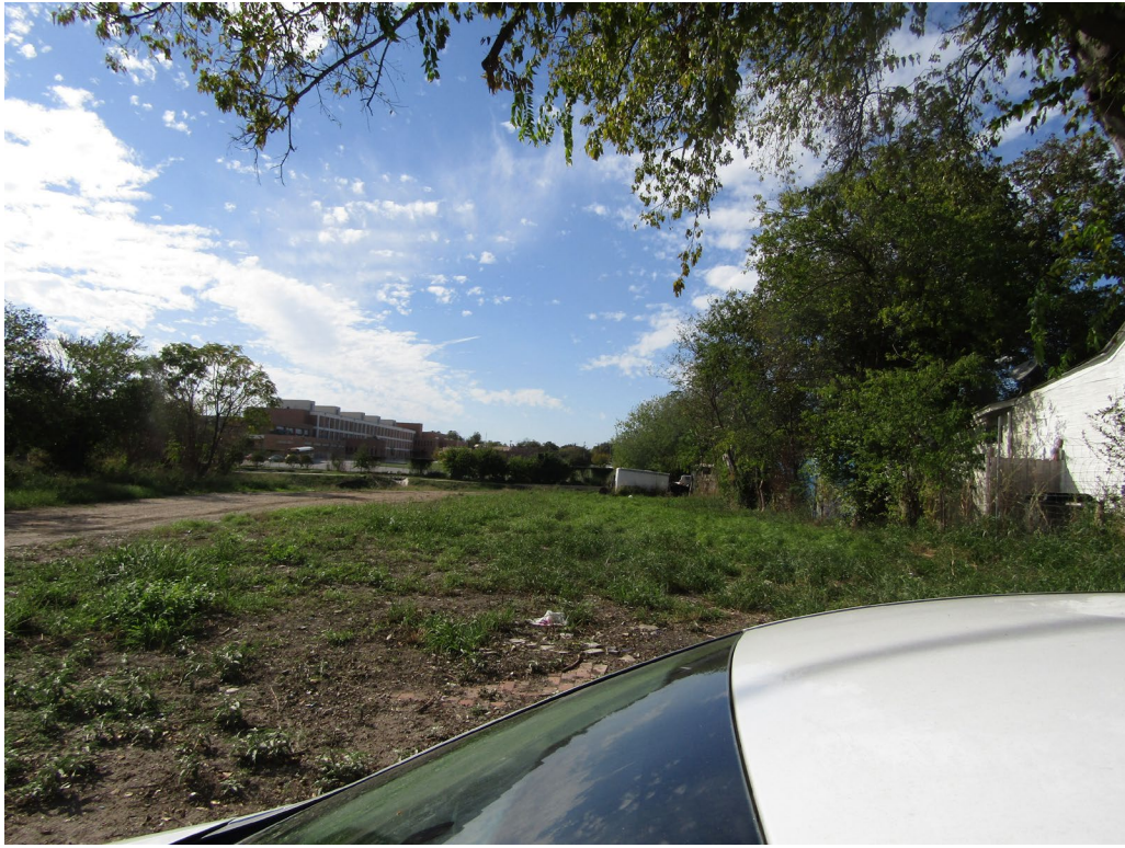
Property next door