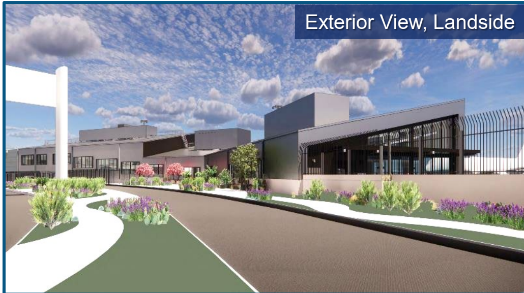
Exterior View, Landside