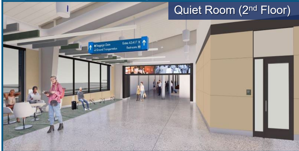
Quiet Room (2 nd Floor)