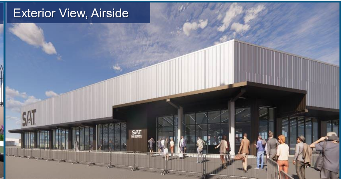
Exterior View, Airside