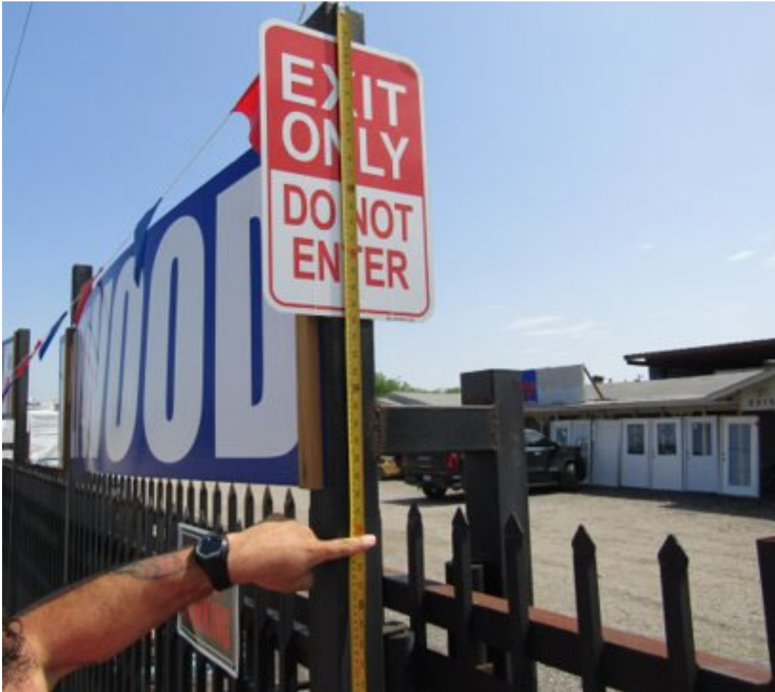
Fence Height without Support Beams