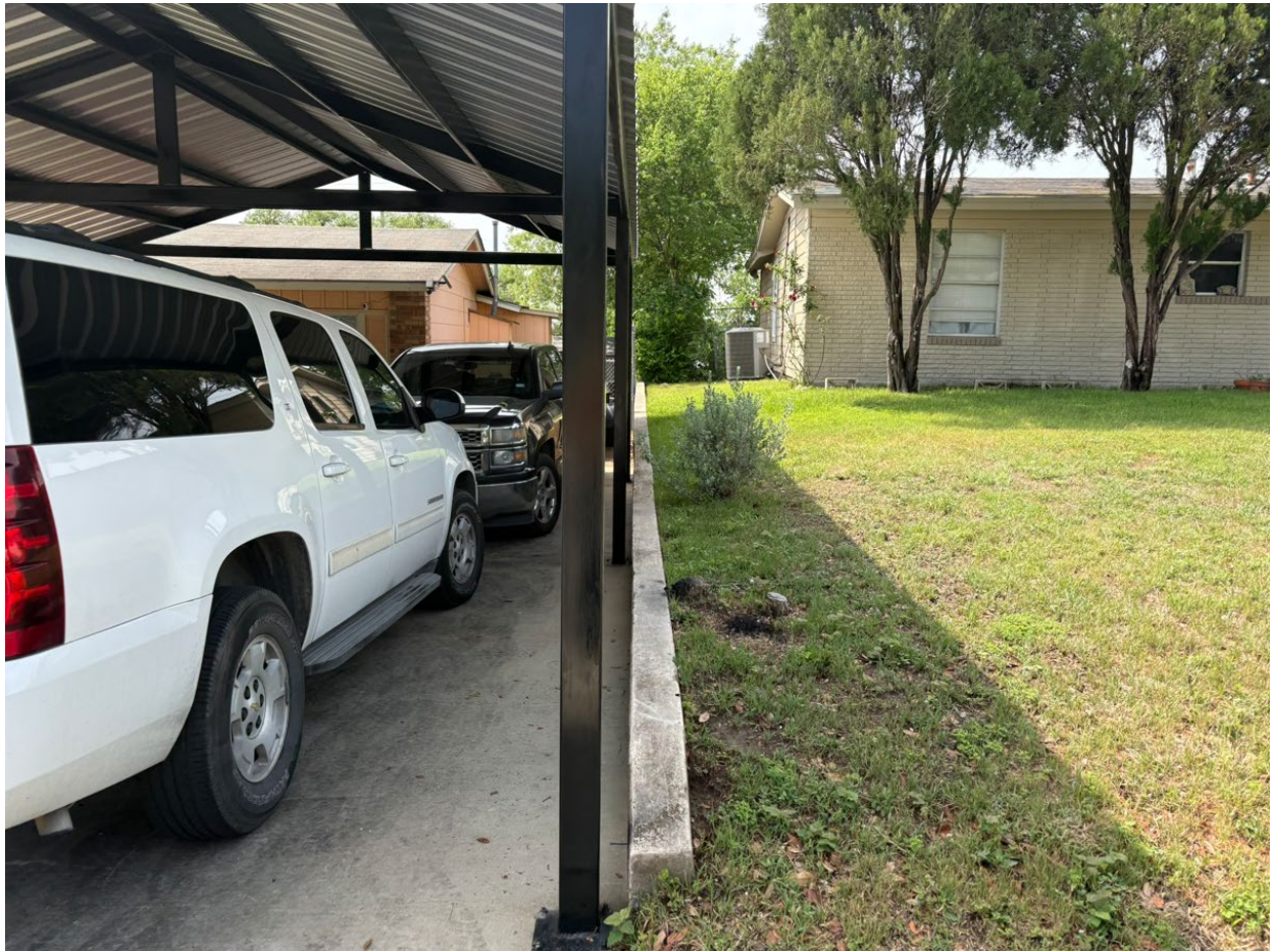
Carport Front Setback