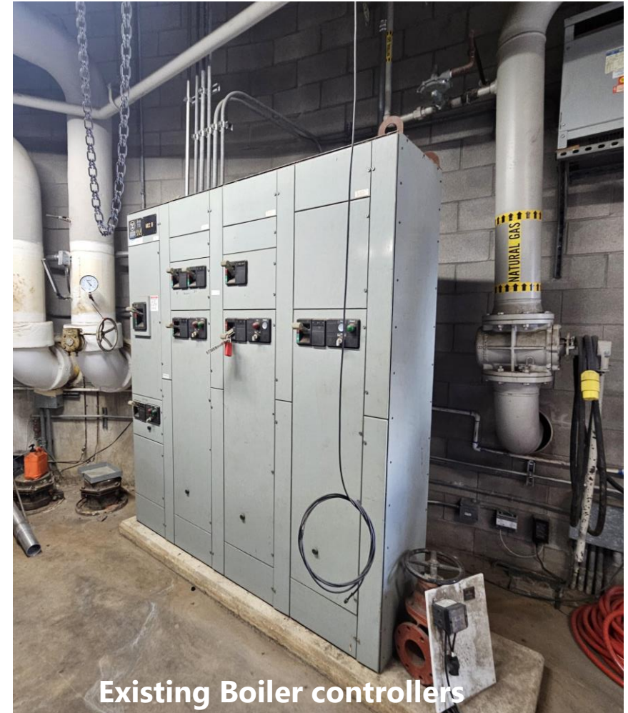
Existing Boiler controllers