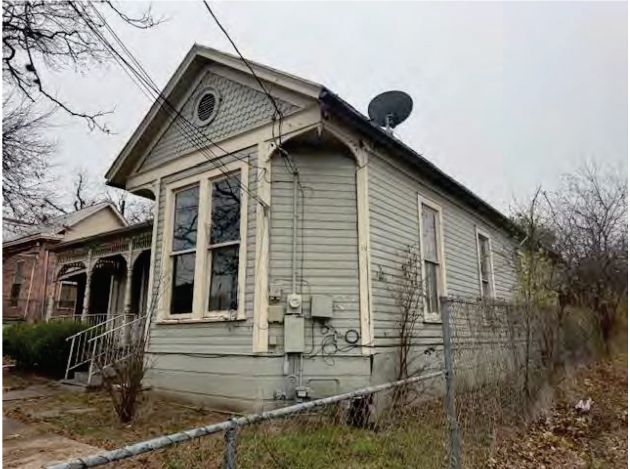
2. 812 Montana Street – Northwest oblique

100 W. HOUSTON ST., SAN ANTONIO, TEXAS 78205