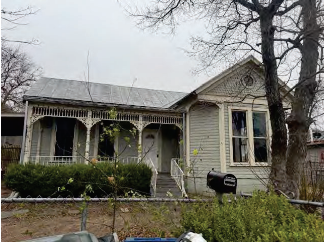
1. 812 Montana Street – Front façade

100 W. HOUSTON ST., SAN ANTONIO, TEXAS 78205