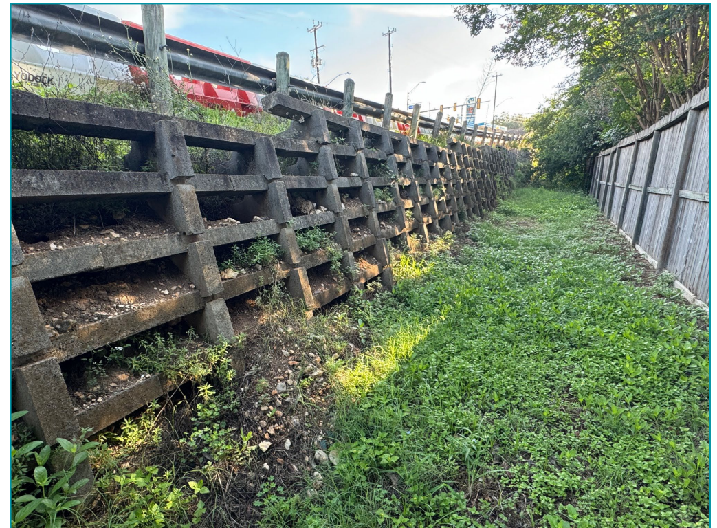
Eroded crib-lock retaining wall