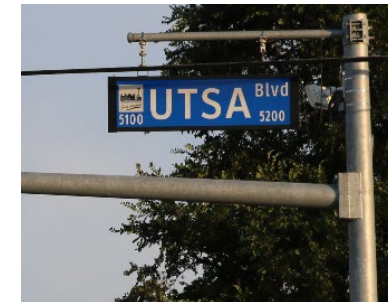
Illuminated Street Signs