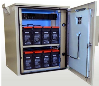
Battery Backup System