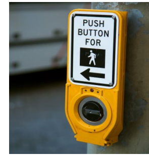
Audible Pedestrian System