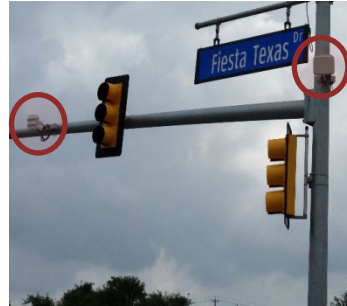
Steel Mast Arms & Vehicle Detection