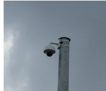
Traffic Monitoring Cameras