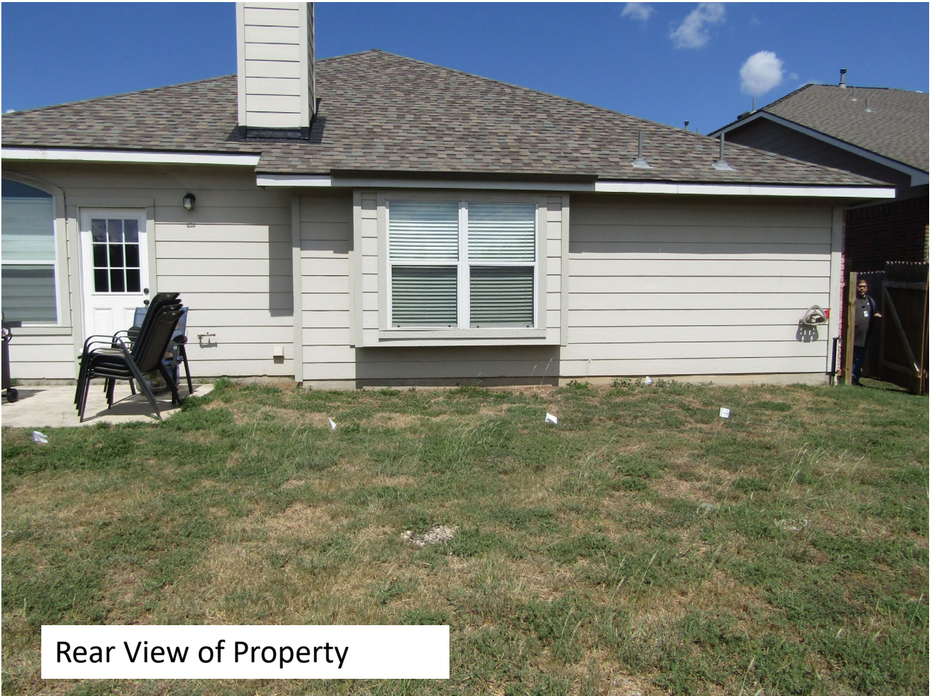
Rear View of Property