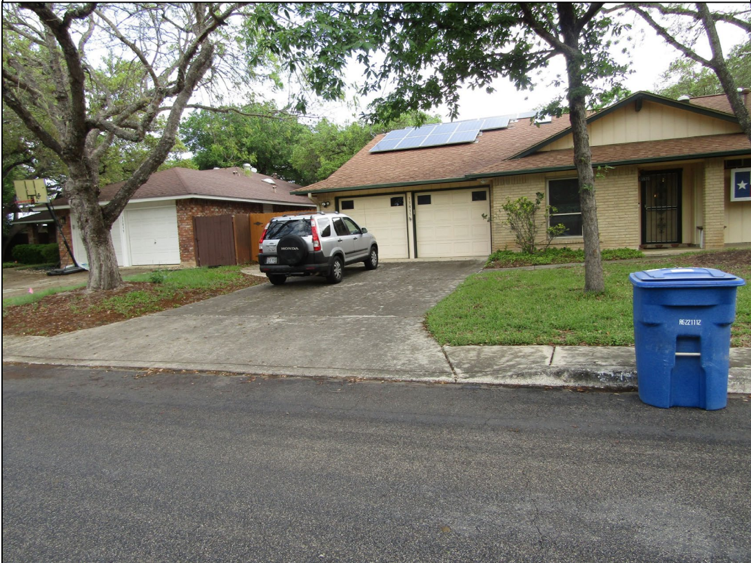
Views of subject property