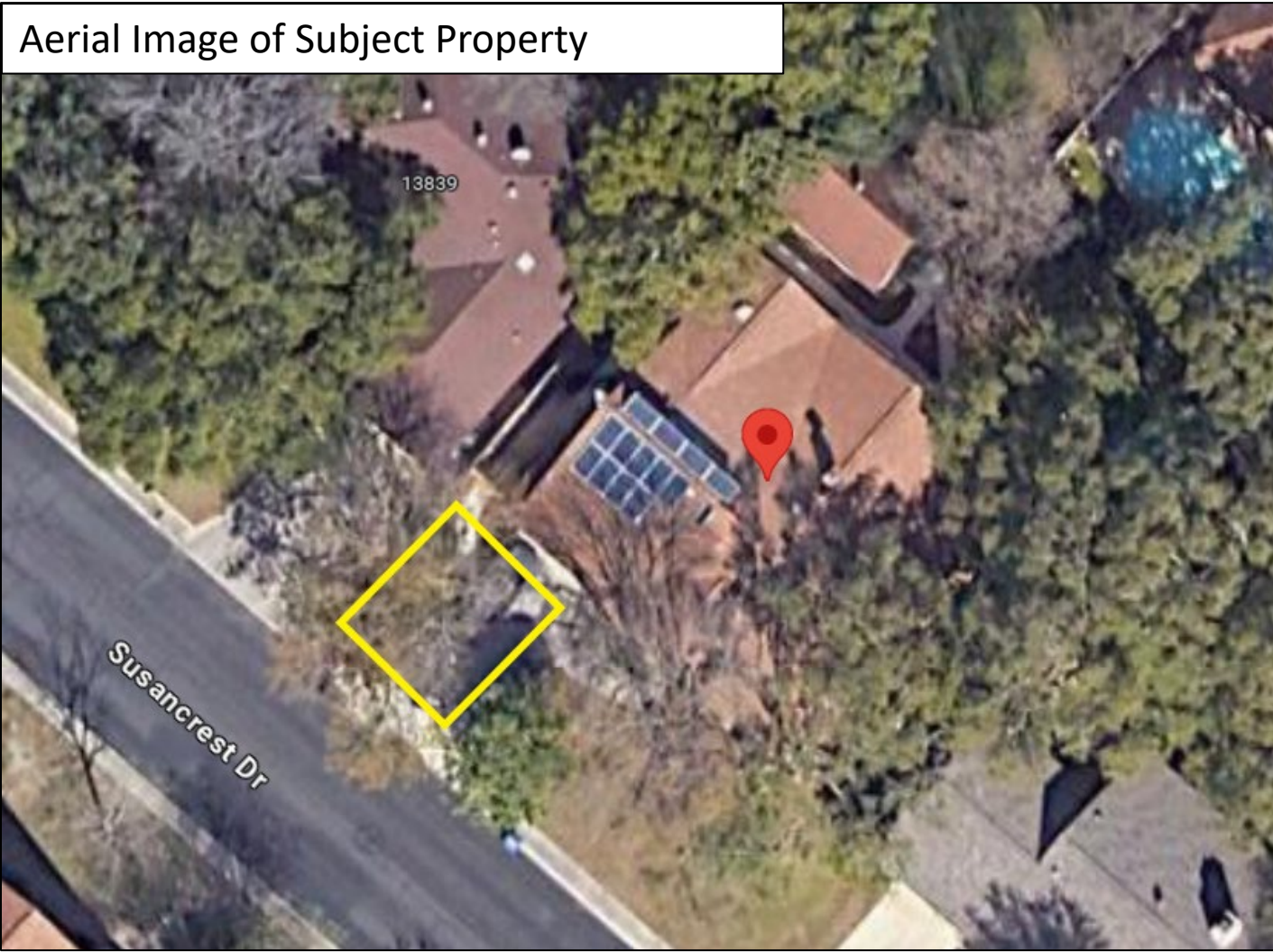
Aerial Image of Subject Property