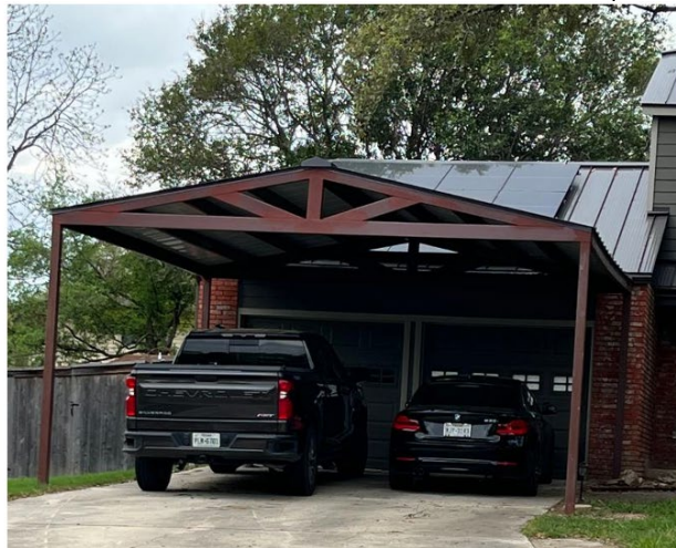
Example of carport in neighborhood

The proposed 20-ft x 20-ft detached metal carport will have a gable roof vs a flat roof. The gable roof design will be more attractive as it will emulate the existing house rooflines. This is a photo of an existing detached metal carport with a gable roof in my neighborhood.