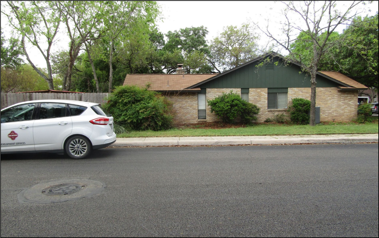
Views across from subject property.