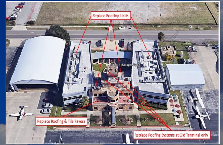
Terminal Roof Replacement