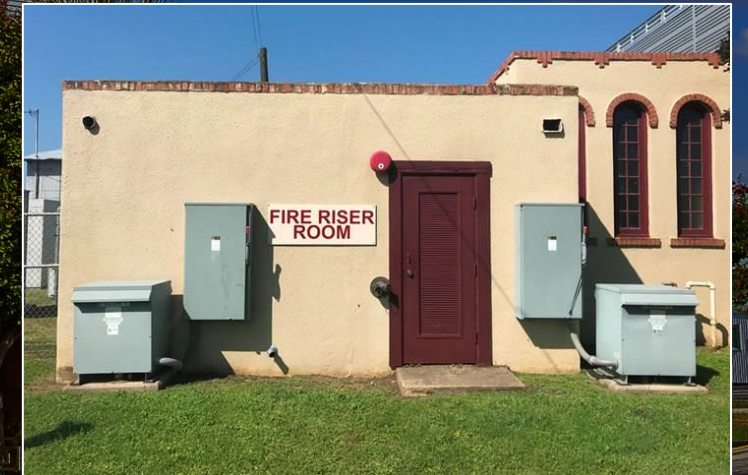
Generator Building Reconstruction