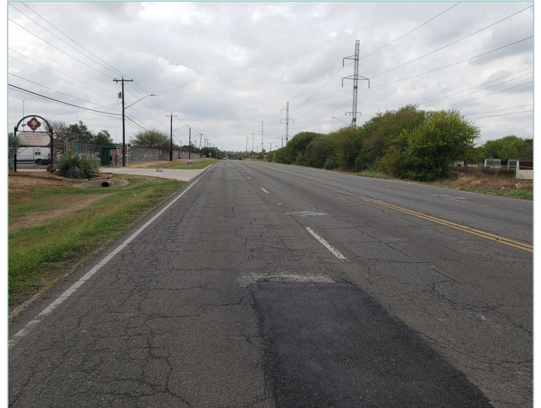
Old Highway 90 looking east by Ron Darner Park Headquarters