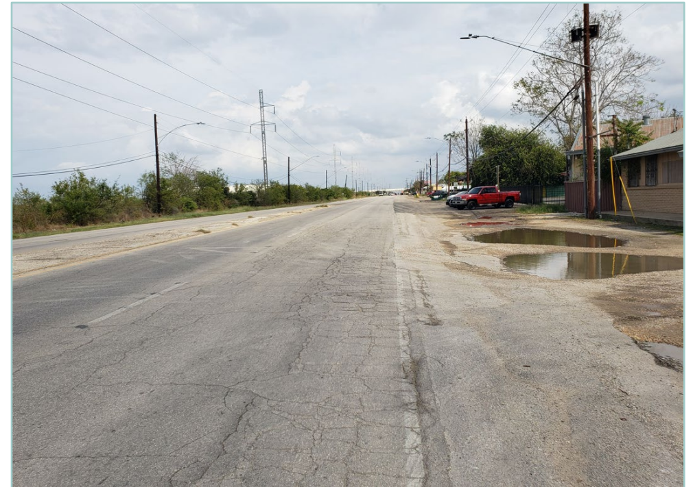
Old Highway 90 looking east