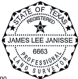
EXHIBIT OF A 35.668 ACRE TRACT

ANTONIO ZAMORA SURVEY NO. 36 ABSTRACT NO. 828 AND JEFFERY B. HILL SURVEY NO. 103 ABSTRACT NO. 308 N.C.B.18225 COUNTY BLOCK 5088, BEXAR COUNTY, TEXAS CITY OF SAN ANTONIO, E.T.J., BEXAR COUNTY, TEXAS CITY OF SAN ANTONIO, BEXAR COUNTY, TEXAS