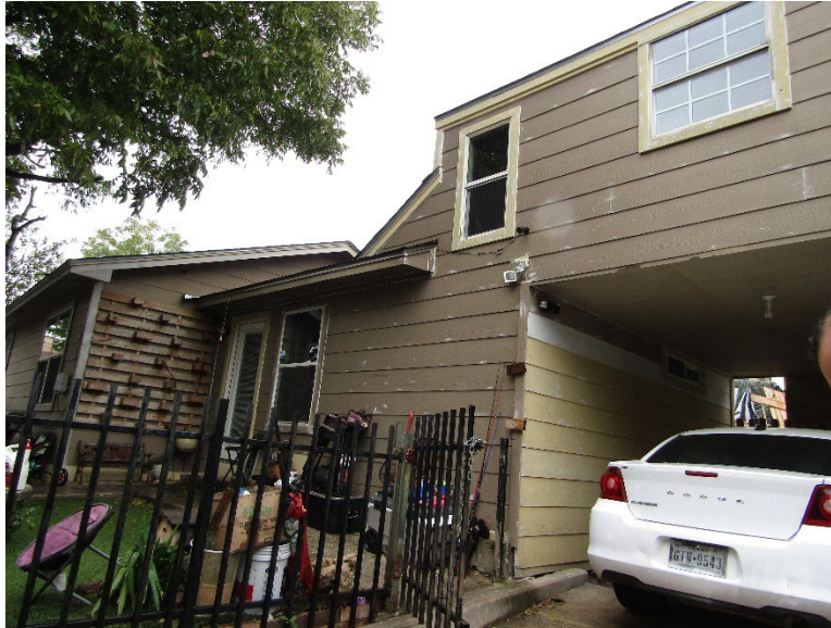
Structure Location Alternate View